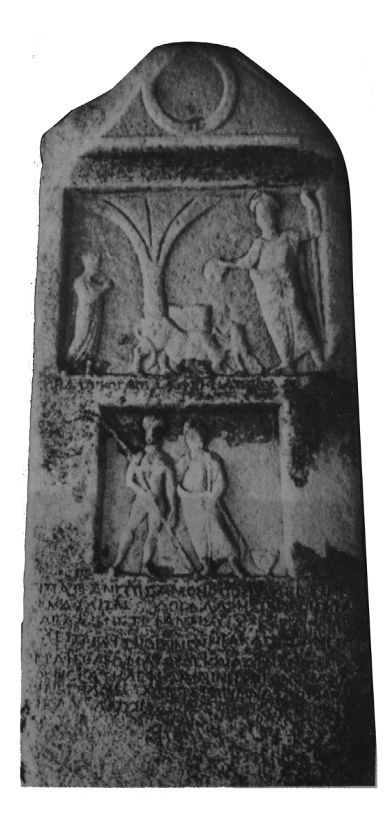
Figure 4.1 Hellenistic grave stele of Doidalses from Mustafakemalpaşa.

Kleonnaeion was not a polis, but rather a topos ("place"), employing the standard military-administrative term for extra-urban sites.<sup>73</sup> This was a key administrative hub in a dispersed landscape, parasitically attached to the