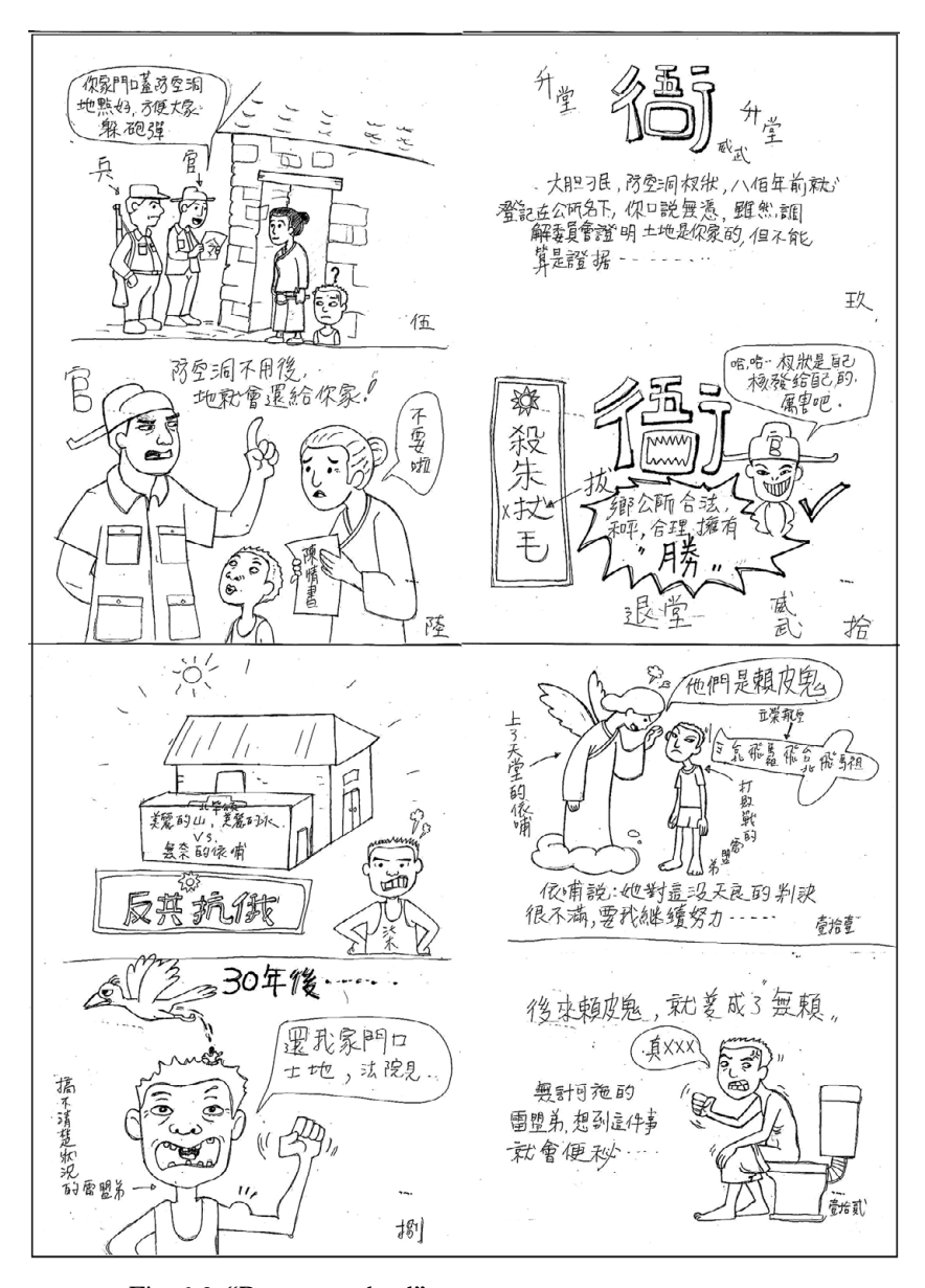
Fig. 6.3 "Return our land" cartoon