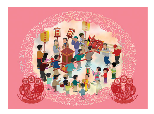
Fig. 6.9 Lantern Festival night in Matsu