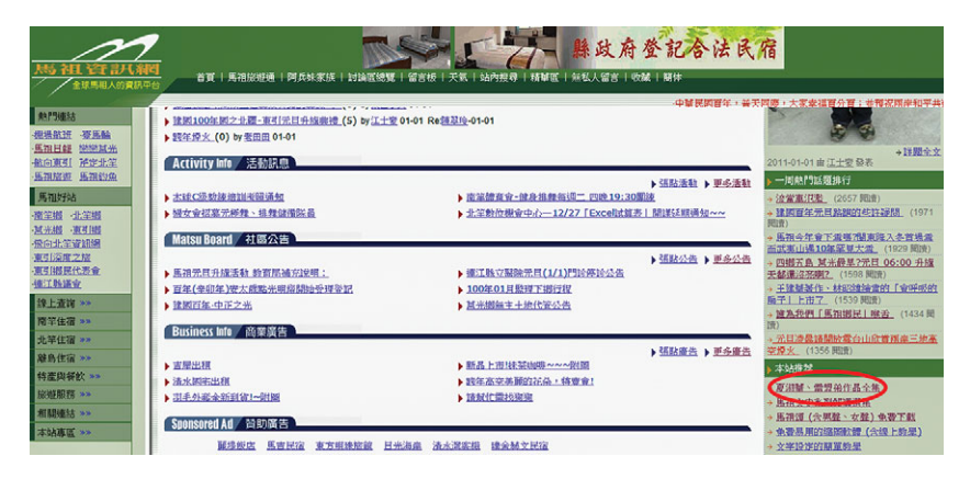
Fig. 6.2 Xia Shuhua-Leimengdi stories on Matsu Online