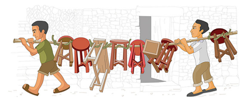
Fig. 6.7 Chairs needed for a wedding banquet