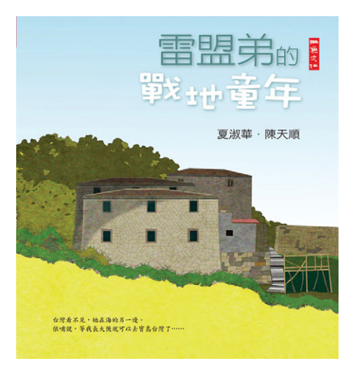
Fig. 6.1 The cover of The Wartime Childhood of Leimengdi

process of subjectification (Moore 2011:80), allowing Chen to transcend these two kinds of self and become a new imagining subject brimming with morals, emotions, and hopes for the future. New media technology played a vital role in this process (Dijck 2007), since its inherent connectivity and immediacy can evoke, respond, and animate intersubjectively, linking netizens in different spatio-temporal locations. In this process, the borderlines between the inner and the outer, the individual and the social are transgressed; new subjects, social relations, and, importantly, a collective wartime memory thus take shape.