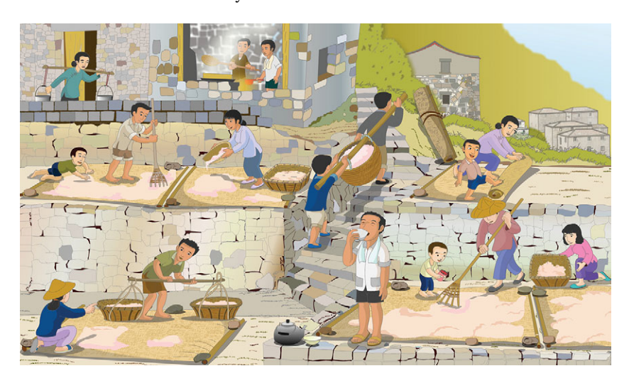
Fig. 6.6 Processing shrimp required the participation of the whole family

while his younger sister watched the youngest girl. Every member of the household took part in its maintenance (Fig. 6.5).