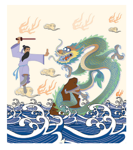
Fig. 6.10 Deity Yang taming demons on the sea