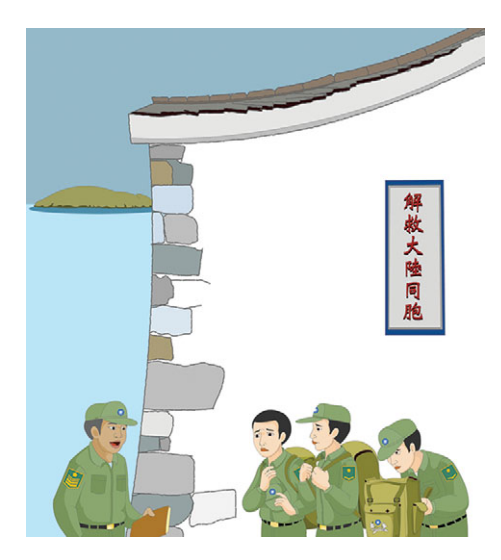
Fig. 6.12 Newly arrived soldiers