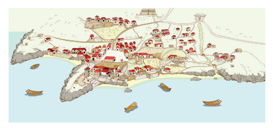
Fig. 6.4 Qiaozi, Beigan (circa 1960)

drawing in the Leimengdi series called "Faraway Childhood" ( yuanfang de tongnian ) (Xia 2005d). When I asked him why he decided to do it, he told me: