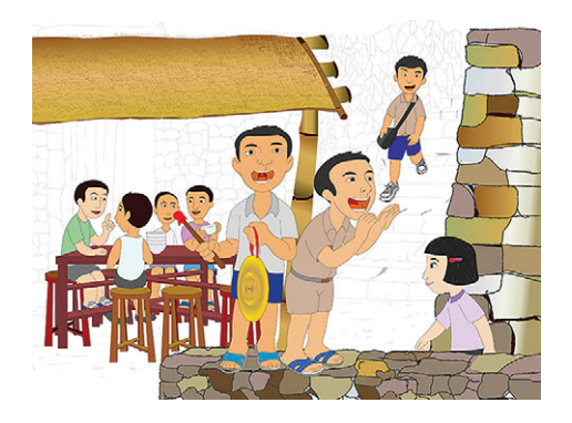
Fig. 6.8 A children's party

banquet began children would beat a gong and shout as loudly as possible, "The gong's ringing, come and drink!" When they heard the sound of the gong, the other children would happily run over to join the fun (Fig. 6.8).