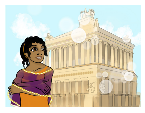
Rejected Princesses: https://www.rejectedprincesses.com/