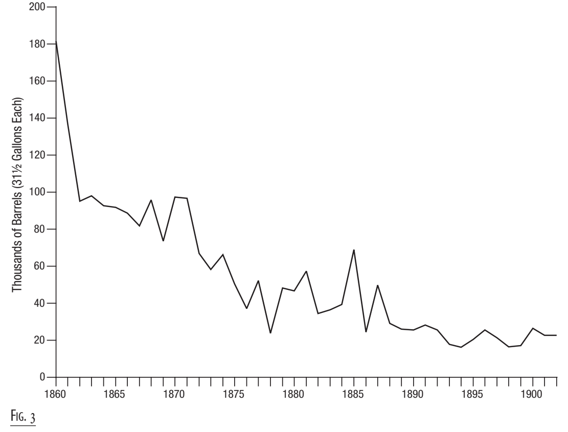
Consumption of sperm and whale oils combined in the United States, 1860–1902 (US, Commission of Fish and Fisheries; Part 28: Report of the Commissioner for the Year Ending June 30, 1902 ; Washington: GPO, 1904; 204; Google Books ; Web; 8 Feb. 2011).

the political unconscious also describe an energy unconscious? Without reverting to crude materialism, I want to suggest that energy invisibilities may constitute different kinds of erasures. Following Jameson, we might argue that the writer who treats fuel as a cultural code or reality effect makes a symbolic move, asserts his or her class position in a system of mythic abundance not available to the energy worker who lives in carnal exhaustion. But perhaps energy sources also enter texts as fields of force that have causalities outside (or in addition to) class conflicts and commodity wars. The touch-a-switch-and-it's-light magic of electrical power, the anxiety engendered by atomic residue, the odor of coal pollution, the viscous animality of whale oil, the technology of chopping wood: each resource instantiates a changing phenomenology that could re-