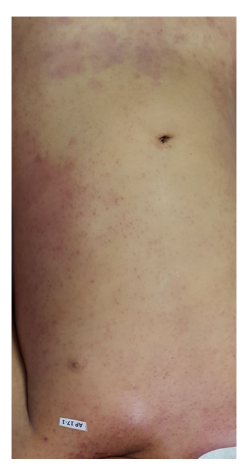
Fig. 1. Petechiae and purpuric lesions on trunk and extremities.

Multiple samples of the liver were recovered during the autopsy and were used to test for TBR by PCR. DNA was extracted using the DNeasy tissue kit (Qiagen, Hilden, Germany), following the manufacturer's instructions for tissue samples. The sample was positive by PCR for Rickettsia -specific primers Rr190.70 and Rr190.701 [17]. PCR products were purified using ExoSap (USB), and sequenced with an automated sequencer (Applied Biosystems model ABI Prism 3130 \times 1 Genetic, California, USA). Sequences (GenBank MF678553) had 100% homology with R. rickettsii (GenBank KX363464).