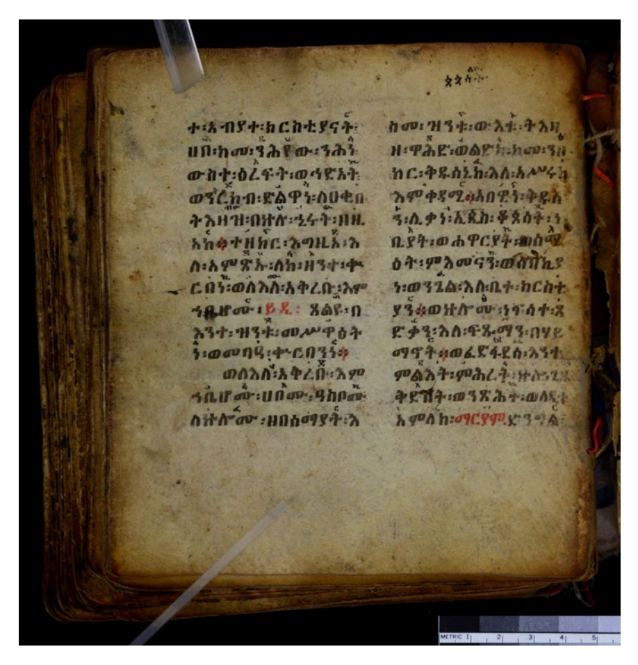
Figure 1. (Colour online) MS MKL-008, Läq̃ay Kidanä Məḥrät (Ethiopia), 1650–60, f. 140v [Mäṣḥafä qəddase]