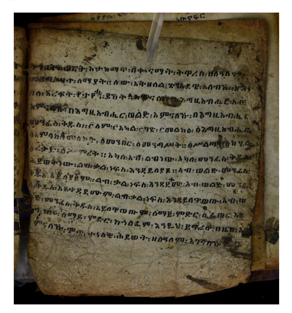
Figure 4. (Colour online) MS MKL-008, Läq̃ay Kidanä Məḥrät (Ethiopia), f. 142r [Märgämä kəbr]

142r, l. 6); cf. also ክርስቶስ (f. 141r, ll. 13–4), where, however, the entire word, including the first letter, is hardly discernible. Likewise, the kink of ሽ in OHሽ in f. 142r, l. 12 is difficult to descry.