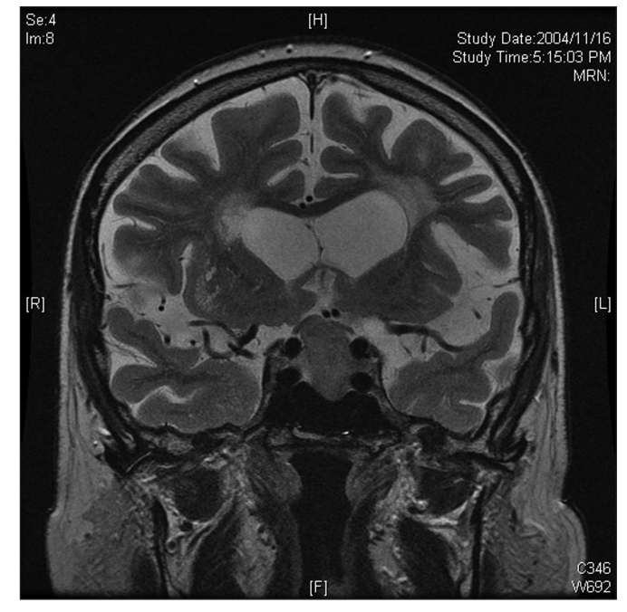
Figure 3: MR image of Case #6 at the time of diagnosis showing NFMA displacing the optic chiasm.

the robustness of the optic chiasm to dislocation/compression from to NFMA contact<sup>6-8</sup>. The relationship between tumor mass effect and progression of visual dysfunction may be more complex than the linear relationship that some reports have previously suggested<sup>10,11</sup>.