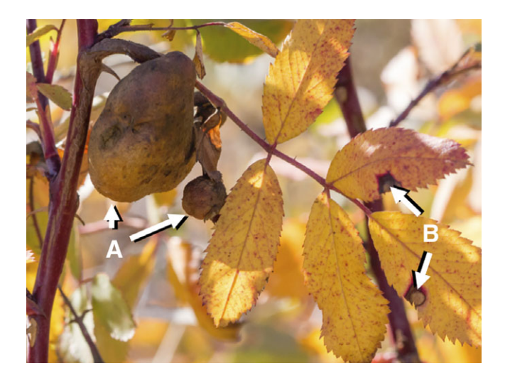
Fig. 1. Galls induced by A, Diplolepis variabilis and B, D. rosaefolii on the same leaf of a Rosa woodsia ramet.

Okanagan Valley of south-central British Columbia, Canada, Rosa woodsii is attacked by seven relatively common Diplolepis species (Lalonde and Shorthouse 2000; Shorthouse 2010). Two such species, D. rosaefolii Cockerell and D. variabilis Bassett, are among the most common and develop at more or less the same time during the late summer and early fall in the area. Both induce galls in leaf tissue and often co-occur on the same plant (Fig. 1). Because of this, both species are available to the same guild of parasitoids at more or less the same time. Although these galls are induced by congenerically close relatives, their shapes are markedly different. Diplolepis variabilis induces a highly polymorphic gall composed of soft corky material and ranges from single-inhabitant forms that are the size of a pea to large, amorphous structures formed from the coalesced galls of many individuals (Fig. 1). In contrast, D. rosaefolii induces much smaller, single-inhabitant, lenticular galls composed of highly sclerotised walls that have a uniform shape and rarely coalesce (Fig. 1).