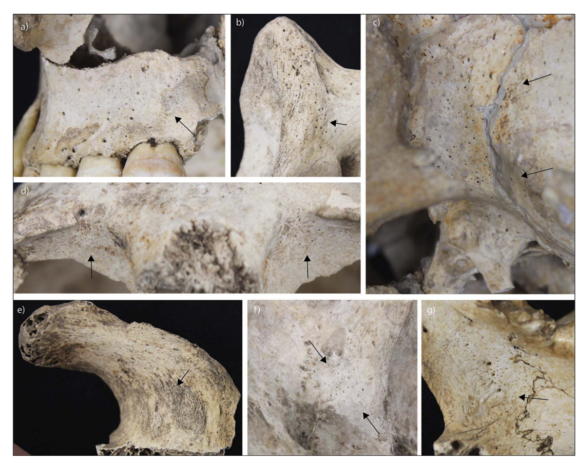
Figure 3. Scurvy features in \overline{O} ta and Tsukumo adults. New bone and/or porosity on a) the posterior maxilla (black arrow; Tsukumo 3, young-adult male); b) the medial right coronoid process of the mandible (Tsukumo 23, old-adult male); c) the left lateral sphenoid and temporal bones (Tsukumo 3, young-adult male); d) the superior orbital roof (note how the porous lesions extend from the supraorbital foramen (black arrows) and are cortically restricted; \overline{O} ta 710, young-adult female); e) the supraorbital sphenoid process of the mandible ( \overline{O} ta 718, middle-aged-adult male); and g) the posterior left zygoma (Tsukumo 60, young-adult female).