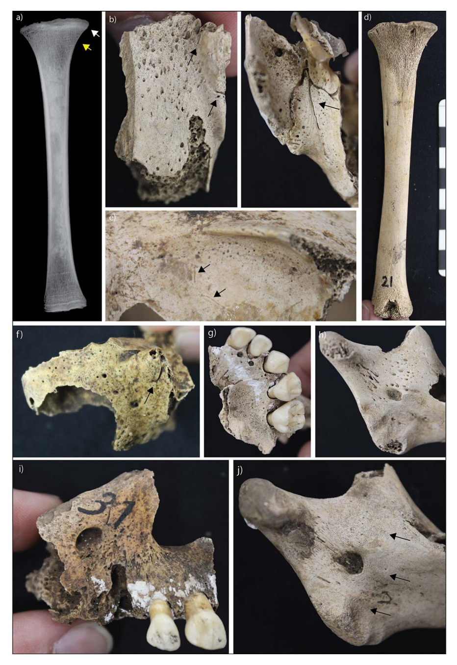
Figure 2. Scurvy features in Tsukumo subadults: a) white lines of Fraenkel (white arrow) and Trümmerfeld zones (yellow arrow) of the tibial metaphyseal plates (Tsukumo 71, age 2 years at death (all ages are approximate)), which appear macroscopically (d) as diffuse endochondral porosity (Tsukumo 21, 3 years). New bone and/or porosity on b) a lateral right sphenoid bone with vascular impressions (black arrow; Tsukumo 31, 2 years); c) a posterior left maxilla/zygoma with vascular impressions (black arrow; Tsukumo 56, 3 years); e) a left orbit with vascular impressions (black arrow; Tsukumo 26, 1.5 years); g) the palatal surface (Tsukumo 21, 3 years); h & j) two medial left coronoid processes of the mandible (h, Tsukumo 56, 3 years; j, Tsukumo 21, 3 years); and i) the anterior maxilla (Tsukumo 31, 2 years) (figure by authors).