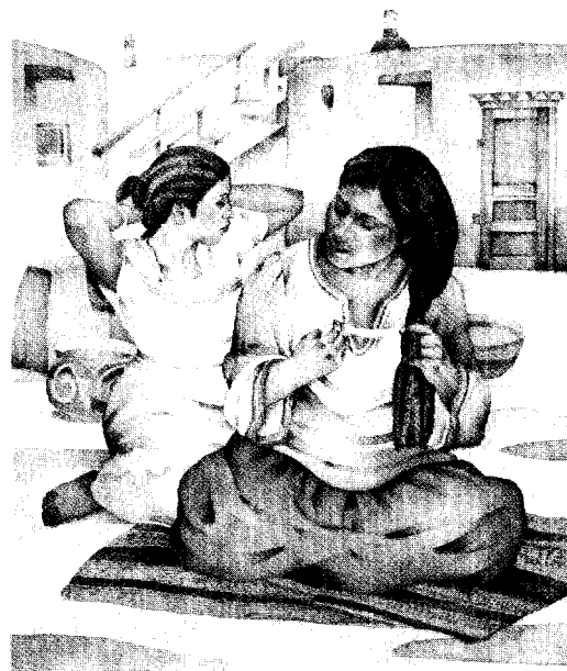
19 x 24 Señoritas de la Villa $85.00