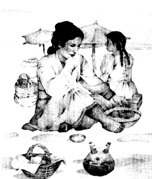
19 × 24 Princesas en la Playa $85.00