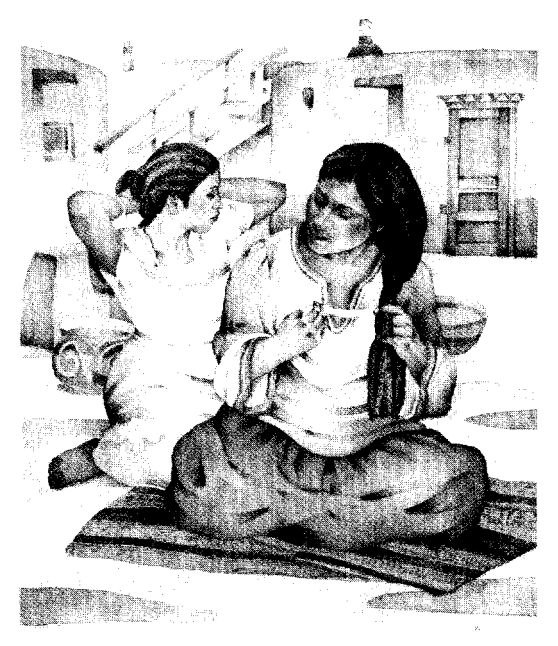
19 \times 24 Princesas en la Playa $85.00