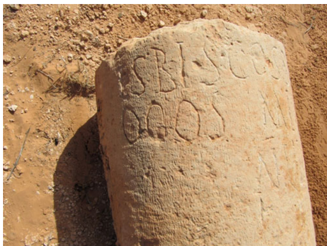
Figure 4. Milestone fragment found near n° 1 (top lefthand).