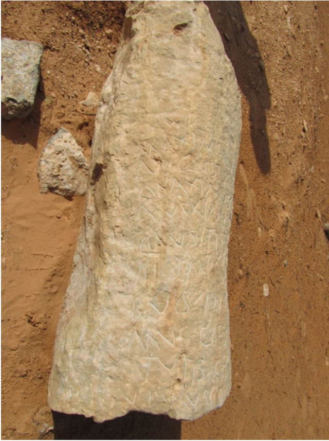
Figure 2. Milestone of Maximinus Thrax. (Photo: A. F. Elmayer, 2007).