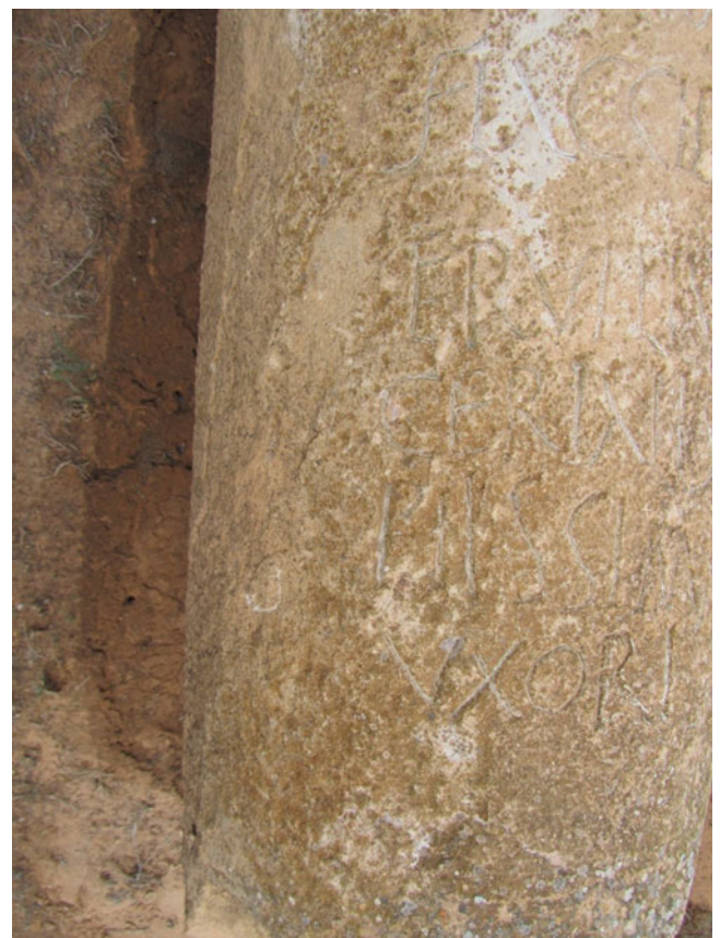
Figure 7. Inscribed limestone column (detail of lines 3–7). (Photo: A. F. Elmayer, 2007).

A column of local limestone found on the surface at a location to the west of Beni Walid, not far from milestone n° 1 (no dimensions are recorded). The Latin text is laid out with some care