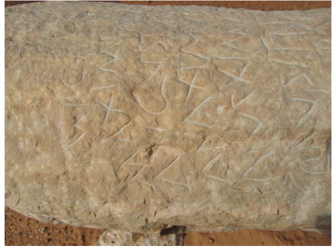
Figure 3. Milestone of Maximinus Thrax (detail showing lines 1–6).

Given its form, the column is very likely to have functioned as a milestone, and the text when complete to have originally