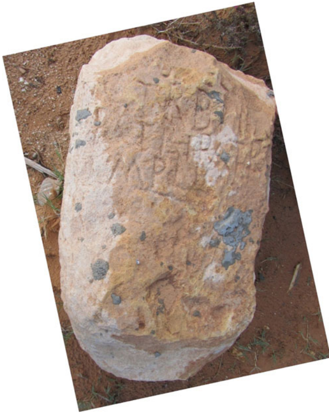
Figure 6. Inscribed milestone fragment..