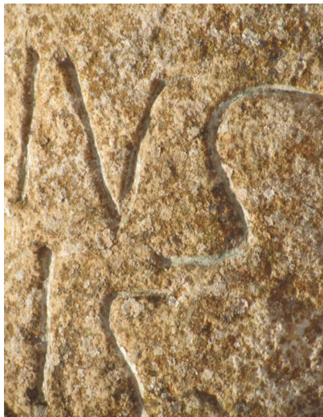
Figure 8. Detail of letters on inscribed fragment

An inscribed stone, bearing parts of two lines of text, seen at another location near Bani Walid, not far from milestone n° 3 (no dimensions are recorded). The location is at the summit of a hill overlooking a small village situated to the north. As in the funerary column (text n° 4) above, the letters are reasonably elegantly carved, if a little irregular. There may be a punctuation mark, perhaps an ivy leaf ( hedera ) at the end of the second preserved line.