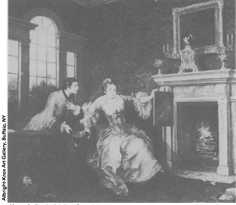
Hogarth: The Lady's Last Stake (1759)