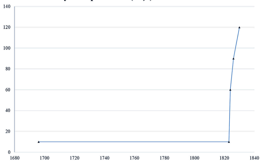
Graph 1: Hourly Rate per Horse (in akee) from 1696 to 1830.

The trend of these price increases—a slow rise and then a relatively big jump in the nineteenth century—was also observed in the prices for sea transportation in Istanbul, and both were likely linked to dramatic inflation during that later period.<sup>41</sup> However, the eighteenth century also witnessed