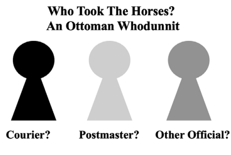
All of the Above?