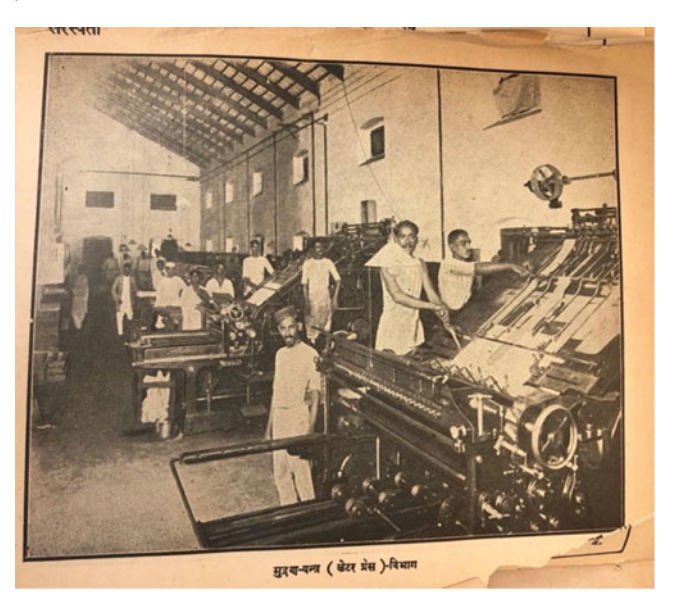
Figure 3. View from inside the Indian Press, 1928—the Letter Press Section.