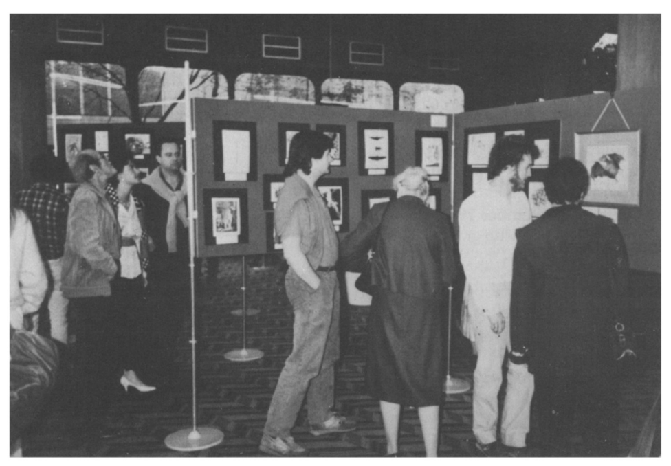
Some of the 500 people who attended 'Bats for an Afternoon' studying the exhibition in the foyer of the Queen Elizabeth Hall in London. It was probably the largest collection of bat art and ephemera ever displayed ( Tim Parmenter ).

talking on various aspects of bat conservation and behaviour. Frank Thornton reading a selection of poetry and prose about bats, and a compilation of bats on film from the BBC archives. More than 500 people attended this successful event, and before and after the show were able to enjoy what was probably the largest exhibition to date of bats in art and culture.