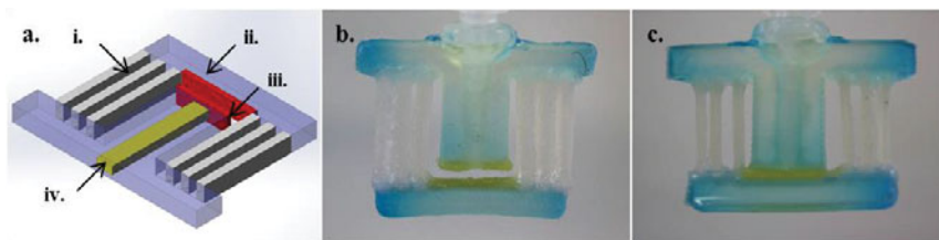
Figure 3 (a.) CAD model of hydrogel valve. Labels indicate components to be printed with (i.) Alg/PNIPAAm ICE hydrogel ink, (ii.) Emax, (iii.) Alg/PAAm ICE hydrogel ink and (iv.) the alginate based ink for printing sacrificial support structures. Photographs of the 4D printed valve open (a.) when swollen in water at 20 °C and (c.) closed when swollen in water at 60 °C.