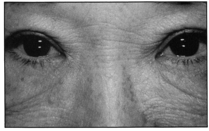
Figure 2 — Pre (above) and Post (below) injection appearance of a 64 year old female patient with bilateral essential blepharospasm. The ''post'' picture is taken one week after injection.