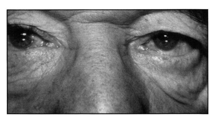
Figure 4 — Age-related entropion left eye showing resolved lower eyelid malposition with absent trichiasis and injection.