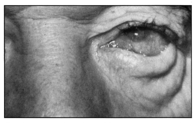
Figure 3 — Age-related entropion: pre-injection appearance of the left eye showing trichiasis, epiphora and injection.

All the patients experienced subjective relief of spasm and excessive blinking within 2 to 3 days of each injection. They had a reduction in severity of their blepharospasm to either no blinking or spasm or to mild blinking excess only. Many patients reported that their best response was the initial one. On subsequent injections, the same or often a higher dose was needed to give a similar relief. Objective evaluation of orbicularis force showed zero power to resist forced opening of the lids by examiner within one week after the injection. Patients with severe spasm, 4+, often needed to return several weeks after the initial injection for a repeat injection of 12.5 units of toxin. In general, large individuals required a larger dose of toxin for maintenance after initial assessment of their response to the starting dose than individuals of smaller mass. Patients of both sexes had a mean of 14.5 weeks between the first and second injections and of 16.9 weeks between the second and third injections. The interval between third and subsequent injections was 9.5 weeks but this figure was based on the artificial cut-off to analyze the results.