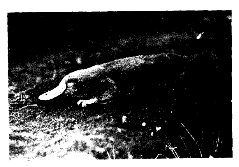
\label{eq:photograph by Miss Mabel Sutherland} Photograph by Miss Mabel Sutherland. \\ PLATYPUS, RUNNING ON ITS KNUCKLES.