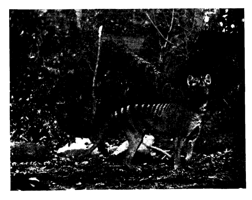
THYLACINE (TASMANIAN WOLF).