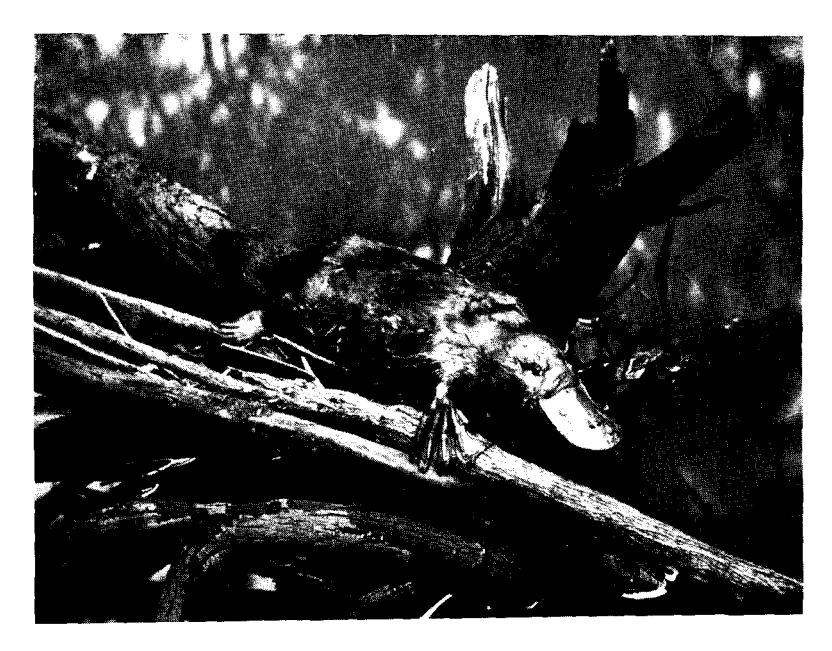
PLATYPUS, SHOWING FOREFOOT.