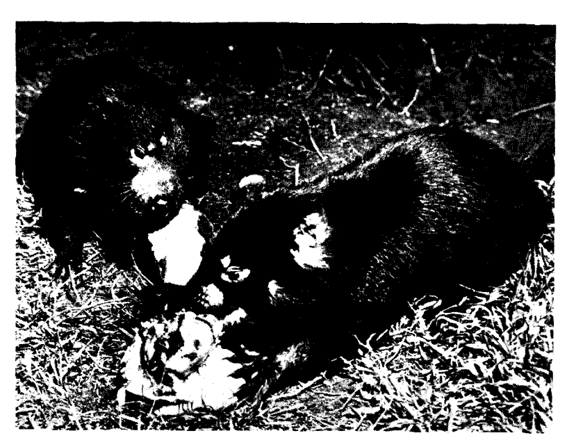
TASMANIAN DEVIL.