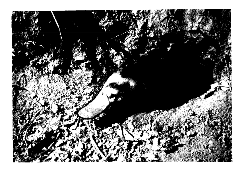
PLATYPUS, LEAVING BURROW.