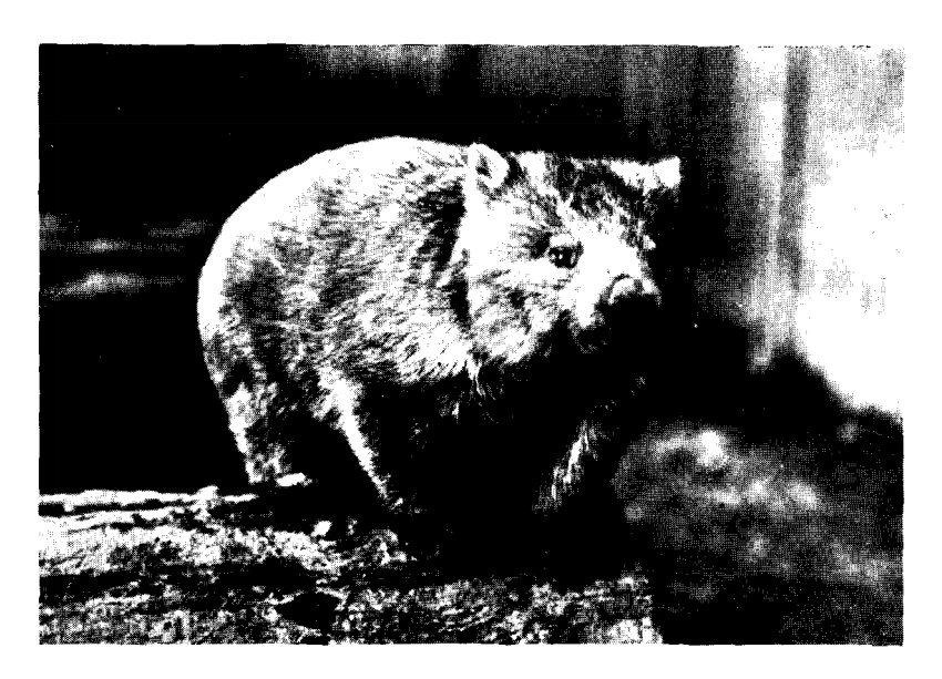
MITCHELL'S WOMBAT,