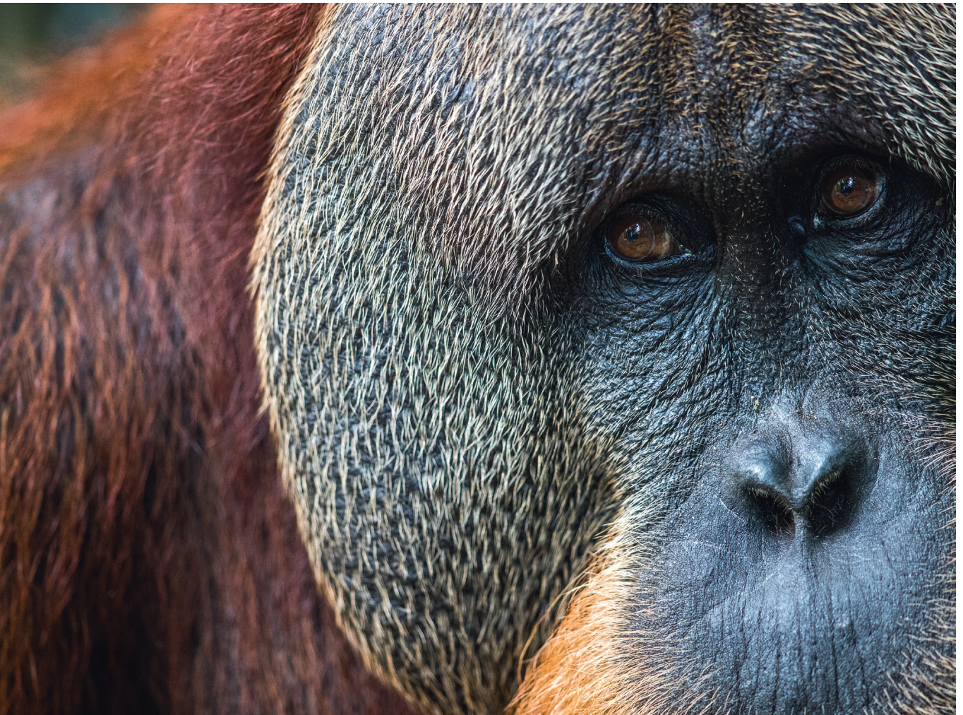
Photo: Apes—humans' closest living relatives—are intelligent, sentient beings with complex social lives. As such, they attract local and international scientists, students, tourists, filmmakers and other visitors in the wild and in captivity. © Paul Hilton/Earth Tree Images

captive (and semi-captive) apes. The aim of a habituation process is to decrease the flight distance of apes when they encounter humans. The removal of apes' fear and need to flee effectively reduces any significant anthropogenic effect on their natural behavior, although some degree of human influence on their behavior is inevitable (Tutin and Fernandez, 1991; Williamson and Feistner, 2011). Moreover, habituation directly heightens the risks of disease spillover to apes, as they tolerate closer proximity to people (Köster et al. , 2022; Russon and Wallis, 2014a). One way of minimizing these risks is to ensure that habituation and