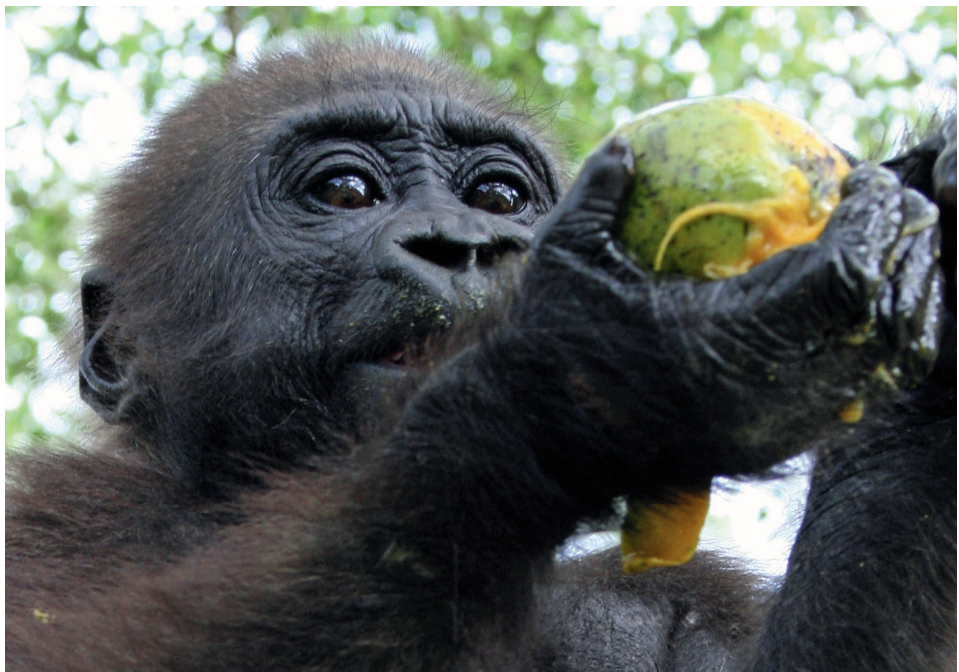
Photo: Apes held as pets by private owners are generally at greater risk of contracting and transmitting infectious diseases, as they live in closer proximity to humans. Illegally kept apes often suffer from various degrees of malnutrition and malabsorption. Juvenile gorilla at a hotel in Gabon. He was later sent to a sanctuary.

Long-term visitors include researchers, documentary film crews, rangers and park personnel, local community members, carers and volunteers for captive and semi-captive