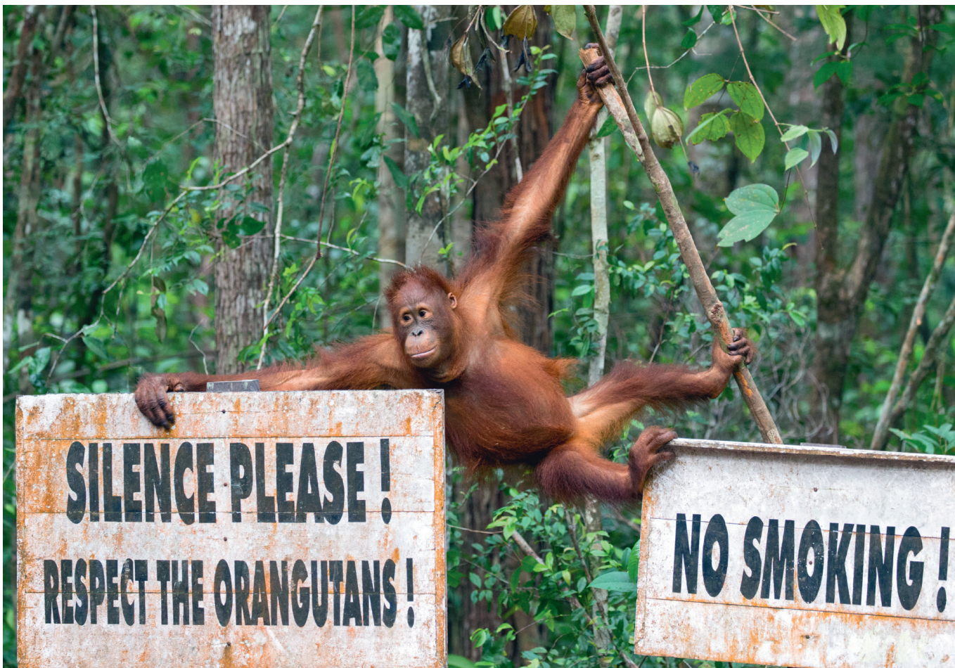
Photo: In rehabilitation sites such as Indonesia's Tanjung Puting in Kalimantan and Malaysian Borneo's Sepilok in Sabah, former rehabilitants not only stopped their usual foraging activities during tourist visitation and food provisioning, but also increased their vigilance and self-directed behaviors. Tanjung Puting National Park, Borneo, Indonesia. © Suzi Eszterhas / naturepl.com

susceptibility to diseases (Sapolsky et al. , 1990; Shutt et al. , 2014; Wasser, Sewall and Soules, 1993; Woodford, Butynski and Karesh, 2002). Studies undertaken during ape habituation processes have documented clinical signs of infectious diseases in chimpanzees, as well as higher parasitic loads in mountain gorillas, although the latter could be related to them living in close proximity to humans, near the park boundary (Fujita, 2011; Morton et al. , 2013). In contrast, analysis of fecal and hair cortisol concentrations shows that wild chimpanzees habituated to ecotourism are not chronically stressed, unlike orangutans and western lowland gorillas (Carlitz et al. , 2016; Muehlenbein et al. , 2012; Shutt et al. , 2014).