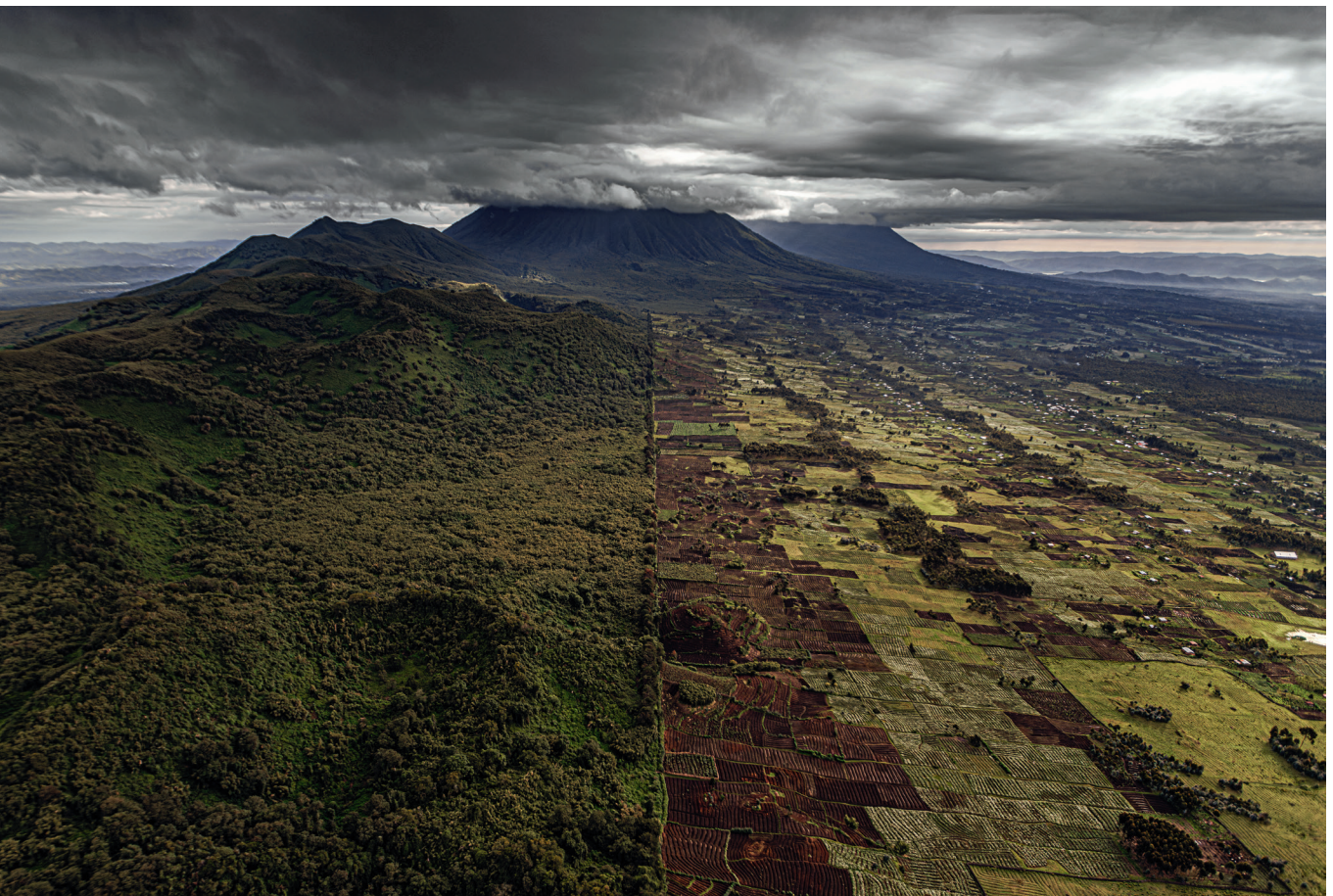
Photo: Habitat destruction leads to disease emergence, but the underlying mechanisms, the prediction and the prevention of possible outbreaks are still poorly understood. Knowing and cataloging pathogens that affect ape species may benefit human medicine while supporting conservation efforts. Habitat conversion along the edge of Volcanoes National Park. © Ronan Donovan

Moreover, the governance of tourist sites that offer visits to wild, habituated ape populations would benefit from the joint input of professionals, including conservationists, ecologists, ape managers, travel medicine specialists and social scientists (Muehlenbein and Ancrenaz, 2009; Munanura, Backman and Sabuhoro, 2013; Russon and Wallis, 2014a). The first step could be to conduct an in-depth assessment of ape visitation sites, including through a cost-benefit analysis of current ape tourism projects and analysis of their contributions to ape conservation. The assessment could give rise to recommendations for improving governance and decision-making processes that guide ape habituation and ape-related tourism.