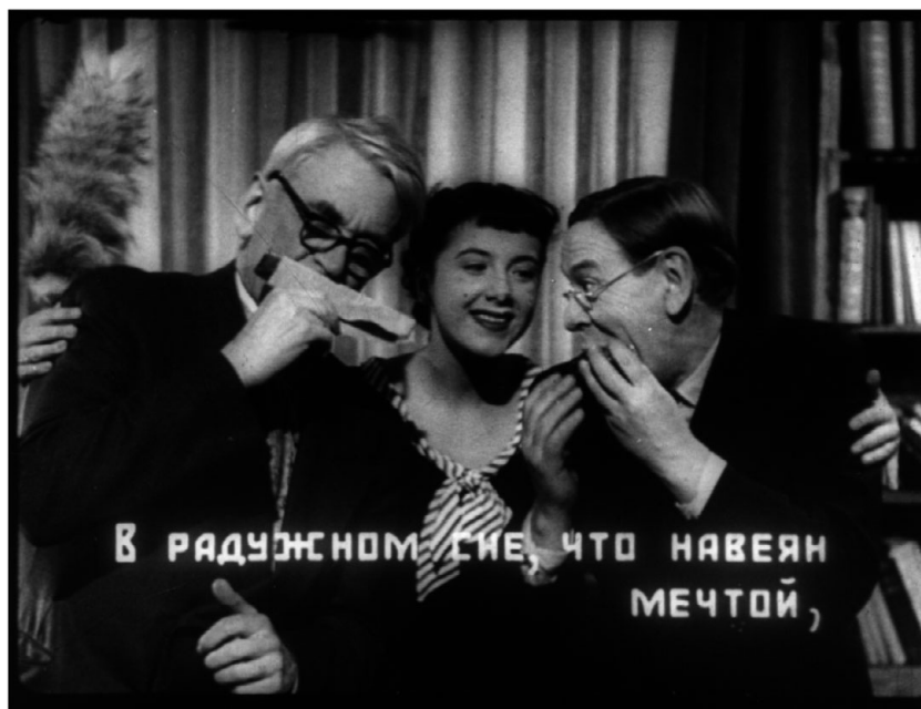
Figure 3. Subtitles in Russian for an unidentified motion picture.