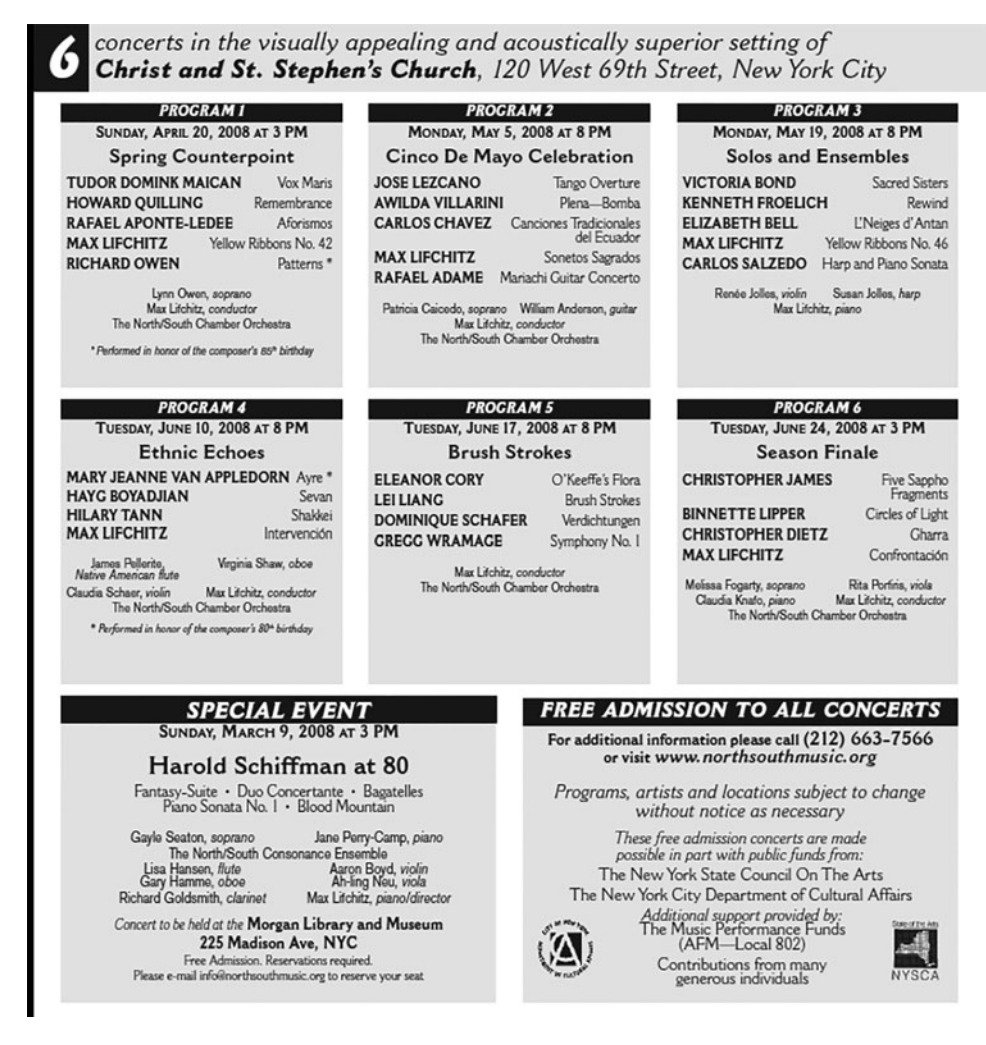
Figure 2. Program of North/South Consonance Inc. Used with the permission of Max Lifchitz Source : http://www.northsouthmusic.org/pdf/nsbro08.pdf.

financing depended on the artists' entrepreneurial skills and, mostly, the private sector.<sup>79</sup> "Arts institutions in the United States," argues Lifchitz, "function primarily through the generosity of private individuals. In general, official support does not exceed more than a third of the budget of any institution. Contrary to what is happening in France or Germany, the [U.S.] government does not want to have much to do with the arts. Out of ignorance, it is suspected that the arts are elitist or even undemocratic "80"