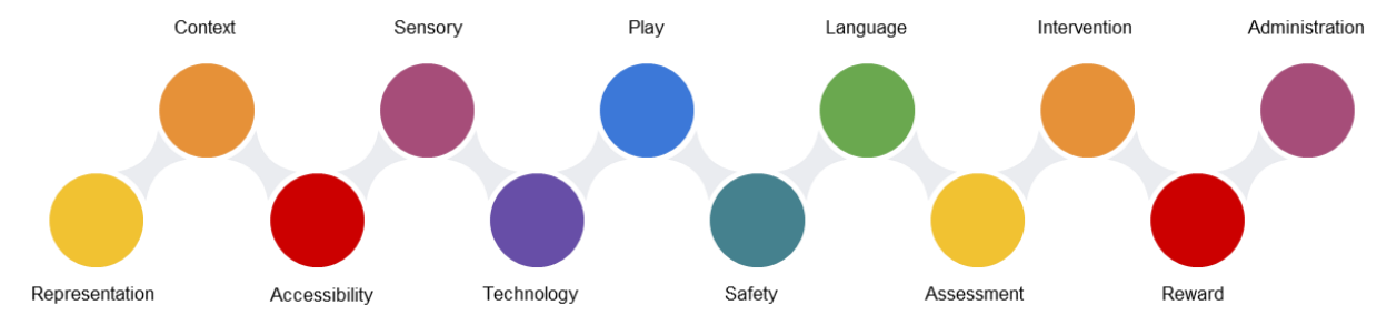
Figure 1. A high-level representation of the Speech and Language Therapy Potential Model

The considerations of end users that designers need to make for SALTT have been listed as a taxonomy of twelve key elements as shown in the Speech and Language Therapy Potential Model (SALT-PM) presented in Figure 1. This model has been evaluated with clinicians working in the field of speech and language therapy in a separate study. Therapeutic toys are another set of toys which share elements with mainstream toys. Each element listed in the SALT-PM is made of sub-elements and the more they are present within a product, the greater its applicability for therapy, hence the name potential model. Furthermore, children can outgrow their condition and thus, the potential of such model also decreases.