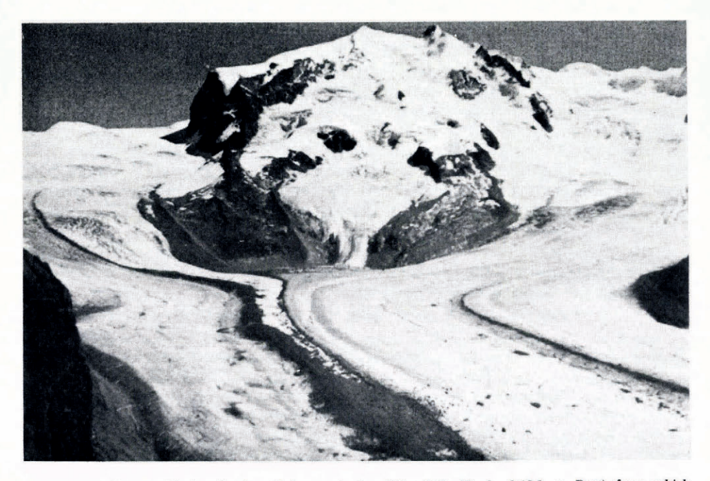
Fig. 3. The Gorner Glacier showing (left centre) the cliffs of the Nordend (Monte Rosa) from which avalanches fall forming the "white lane" which finishes in the centre of the photograph. The ice hummocks shown in Fig. 4 were photographed at the sharp bend of the white lane beneath Monte Rosa