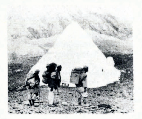
Fig. 1. Ice pyramid on the Baltoro Glacier 45 m. high. Note figure near base