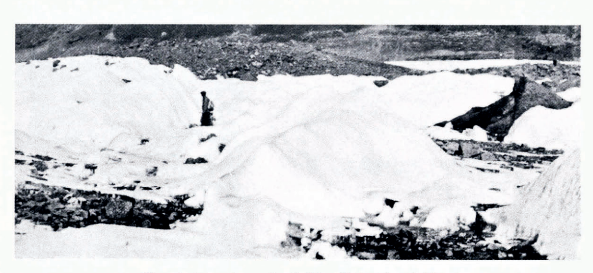
Fig. 4. Ice hummocks near the end of the white lane shown in Fig. 3