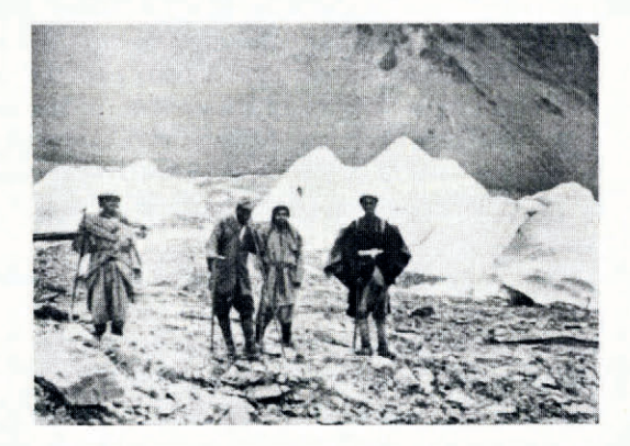
Fig. 2. Ice pyramids. Note figure