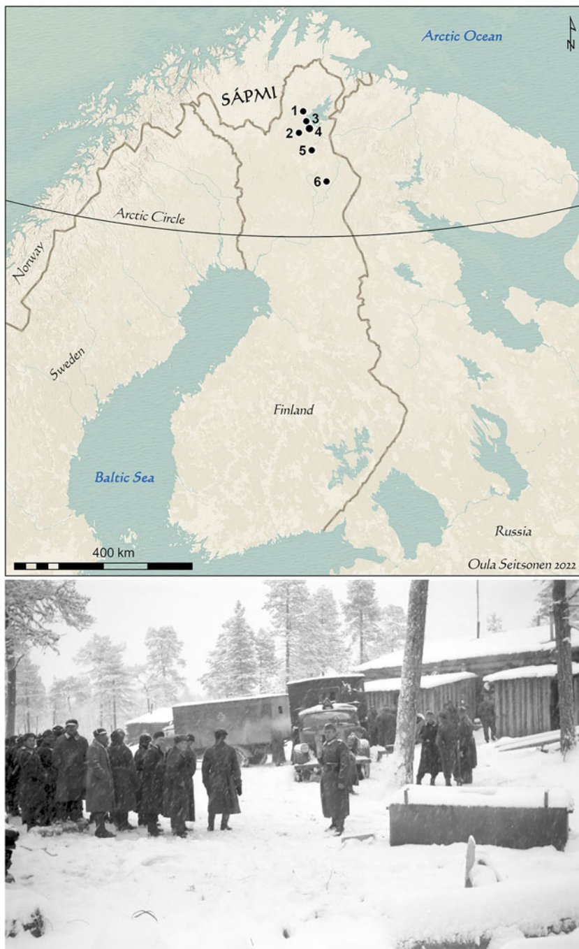
Figure 1. Top: Multinational Sápmi and the discussed sites in northern Finland. (1) Inari Hyljelahti; (2) Inari Haukkapesäoja; (3) Inari Kankiniemi; (4) Inari Martinkotajärvi; (5) Sodankylä Kopsusjärvi; (6) Savukoski Seitajärvi. (Background map: Esri.) Bottom: Soviet Prisoners of War (on the left) outside their log house with German guards (on the right) at Inari Haukkapesäoja, Lapland.

are still very much in the margins of both the research and the grand narratives of modern war. 1 Nonetheless, there are indications that superstitions, with their material/talismanic expressions, abounded also during WWII, as illustrated by MacKenzie's (2015; 2017; see also Gregory 2019) research on superstition as a means of coping with the constant threat of death. Recent work in Finland has indicated that premonitions and other strange ('supernatural') experiences were common among Finns both on