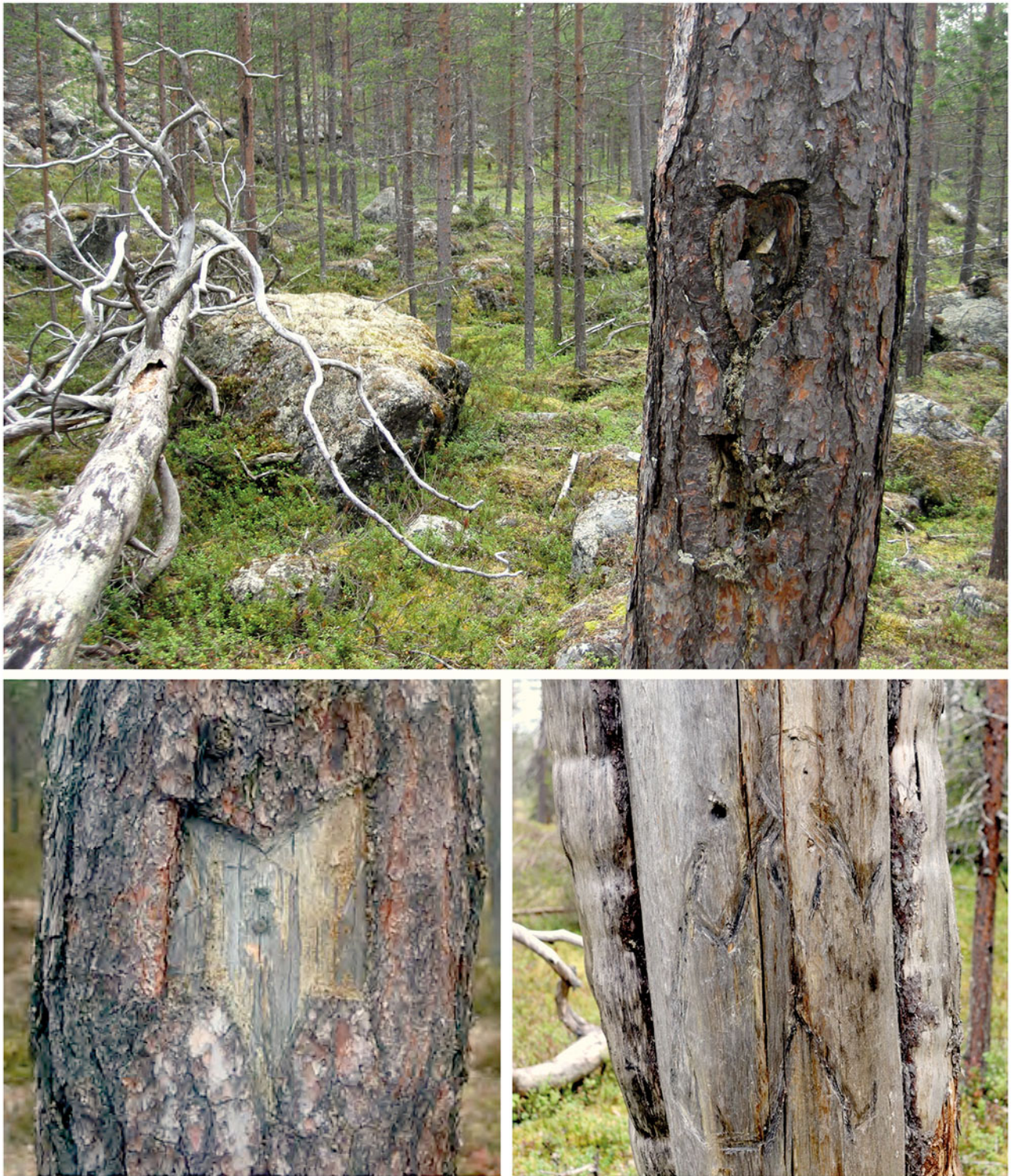
Figure 7. Top: Heart carved into a pine at the Kankiniemi PoW camp. Bottom left: 'Partisan star', a pentagram carved on a pine along a German-built wartime Kopsusjärvi track in Sodankylä, with a bullet hammered into its centre.