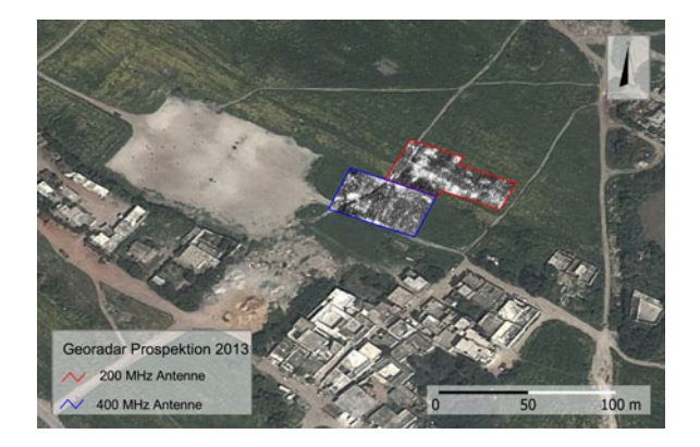
Figure 2. Results of the georadar survey, the upper part using deeper penetrating 200 Mhz antenna in the cavea area, the lower part 400 Mhz antenna in the arena area (M. Broisch).

Several phases predating the erection of the circus are clearly distinguishable in Trench A. Earliest activities, starting in the Middle Punic period, combine cavities worked into the in situ rock and post holes. The system changed several times but continued into the Late Punic period. Stone walls from the latest artisanal/domestic phase were dismantled in the early Roman period. We expect a more