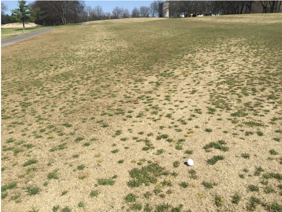
Figure 1. Glyphosate-resistant annual bluegrass ( Poa annua L.) infesting a dormant bermudagrass ( Cynodon spp.) golf course fairway in Rockford, TN.

thoughts on how continued evolution of herbicide-resistant weeds in turfgrass may affect weed management specialists on golf courses, sports fields, and lawns.