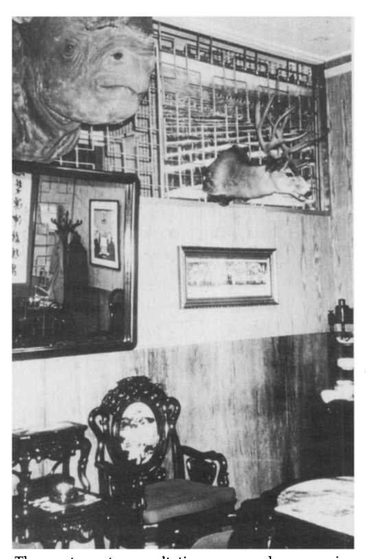
The most ornate consultation room we have seen in any traditional pharmacy is this one in Taiwan. Mounted heads of animals used for medicinal purposes loom over the clients while they sit on replicas of imperial Chinese chairs ( Chryssee Martin ).

These examples of profligate spending illustrate the need in Taiwan to close down all avenues allowing the purchase of endangered wildlife and its products. The 1985 ban against rhino horn and hide imports had been ineffectual at least partly because these products could still be traded internally. We urged the banning of domestic sales some years ago, conforming to the CITES Resolution Conf. 6.10, which has been enacted in Hong Kong