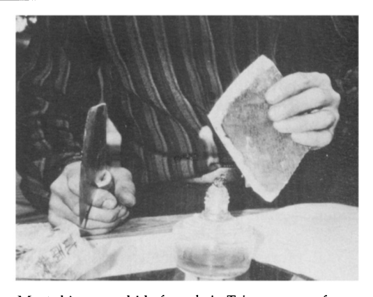
Most rhinoceros hide for sale in Taiwan comes from white rhinos. In early 1990 the average retail price for one kg in Taipei's pharmacies was $US270. This piece is being heated to make it more malleable for cutting into slices ( Chryssee Martin ).

and Macao with success. Taiwan's Legislative Yuan passed the Wildlife Protection Act in June 1989, which bans and imposes penalties, including fines and detention, for catching, maltreating, killing, importing, trading, exchanging or attempting to display any endangered species or parts thereof. However, the authorities have not yet put it into practice. In a night market we saw young orangutans being used to attract customers to booths where snakes and terrapins were slaughtered to provide aphrodisiac potions; we were invited to play with a bear in a cage behind a fitness centre; a diplomat told us he had recently been offered a baby orang-utan on a street corner in the middle of the capital city; and, although the amount of rhino horn available in the medicine shops was less than we had found previously, it was still publicly displayed and for sale to anyone who wished to purchase it.