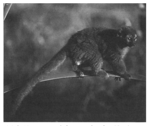
Adult Alaotran gentle lemur or bandro, Hapalemur griseus alaotrenis, on papyrus stem at Lac Alaotra Madagascar.

for the conservation status of the Alaotran gentle lemur are discussed.