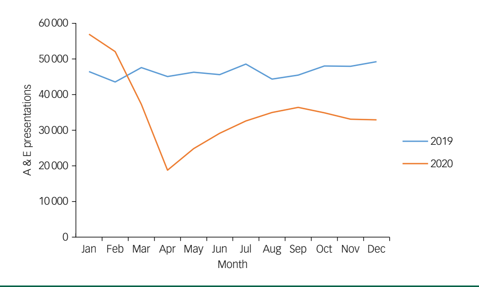
Fig. 2 Accident and emergency department (A&E) presentations per month, from January 2019 to December 2020.

The ITS analysis showed abrupt reduction of psychiatric presentations after the lockdown: 1 week after the lockdown initiation on 23 March 2020, the average number of presentations was 78.4% (95% CI 67.4–91.2, P=0.002) of the pre-lockdown average, dropping from approximately 175 to 140 presentations in the first week after lockdown (Table 1 and Fig. 3). The long-term slope before lockdown showed a negligible rate of decrease in psychiatric presentations (-0.2% per week, 95% CI -0.4 to 0.04, P=0.123). This long-term trend changed in the weeks after lockdown (+1% per week, 95% CI 0.5–1.1, P=0.003). In the sensitivity analysis, this model performed better than the alternative impact model of gradual change after lockdown (see Supplementary Appendix 1, section 3). We attempted an ITS with monthly referral data for psychiatry, but this model was weaker because of the smaller numbers of time points (see Supplementary Appendix 1, section 5).