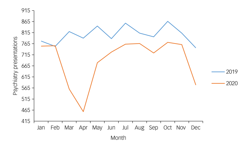
Fig. 1 Psychiatric presentations per month, from January 2019 to December 2020