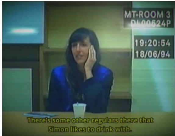
Figure 2. Screenshot: subtitle