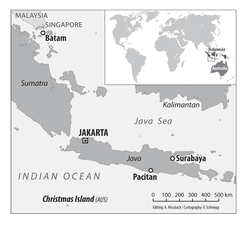
Figure 1. Map with smuggling operation sites

The trial court then convicted the men but, much to the frustration of the Attorney-General's Office, the drivers were sentenced to two years in prison, contrasting with the experience of drivers in other smuggling operations tried in other courts, who had received the much more severe minimum sentence. The Attorney-General's Office appealed on the basis that the judges had not fully applied the law in their verdicts. The reviewing judges increased the sentences, which were still below the minimum sentence. Subsequently, the Supreme Court rejected the Attorney-General Office's second and final appeal, arguing that the new sentences were severe enough already. Judges have also ignored statutory minimum sentences for other crimes, such as corruption and possession of illicit drugs, so these below-minimum sentences for migrant smuggling are a further resource for examining the extent of judicial discretion in the Indonesian judiciary.