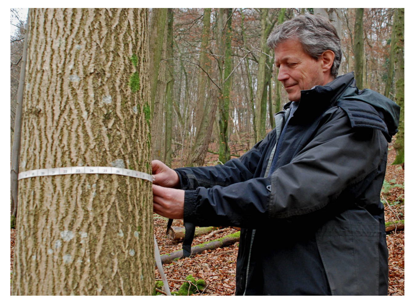
Figure 4. Alan measuring trees as part of ecological survey at Lady Park Wood. In colour online

Orange A (1995) The British species of Lepraria and Leproloma : chemistry and identification. British Lichen Society Bulletin 76, 1–9.