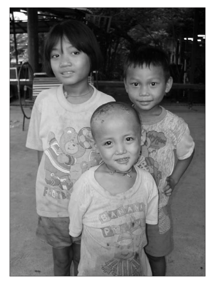
Children at the clinic