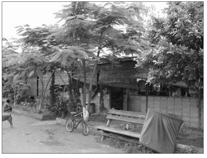
Inpatient clinic in Thailand

The target population is about 150 000 people who live along the border between Thailand and Myanmar. The clinic provides free health care to the increasing numbers of Myanmar refugees, migrant workers and people crossing the border from Myanmar. Last year the clinic saw