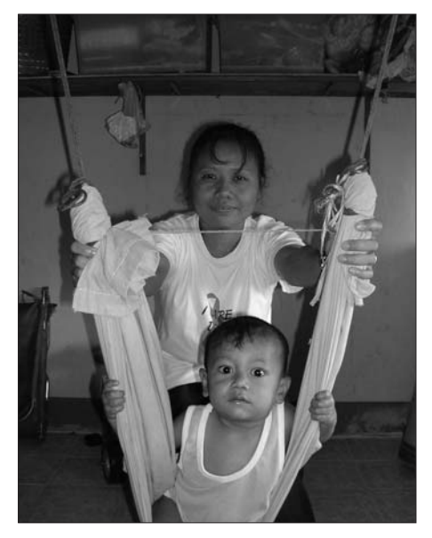
Medic pushes an orphan on a makeshift swing

known reference value and holding it up to natural light. The dark clouds make hemoglobin assessment particularly difficult during the rainy season. Based on the clinical assessment, he was given a blood transfusion, treated for malaria and made a rapid recovery within 24 hours.