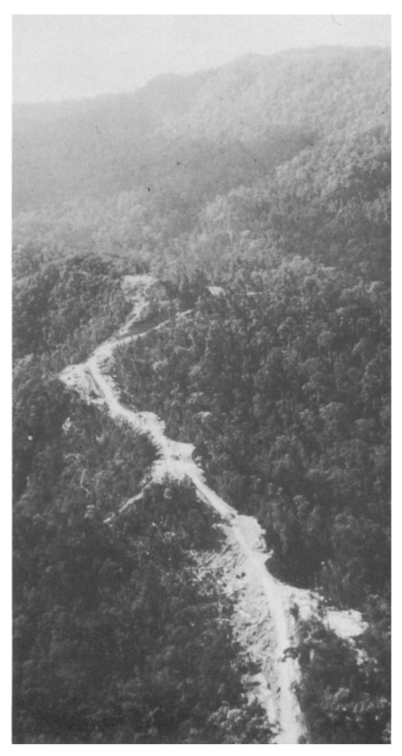
Ridgetop access road through part of the Sungai Tekam Concession.

Logged forest might be expected to support fewer primates than primary forest, since many food sources are lost. Most colonising species in regenerating forest do not produce fruits that are eaten by primates, and their leaves carry a high level of secondary compounds making them distasteful. Group density does not, however, Forest primates and logging