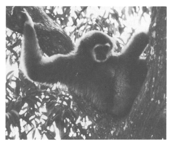
Lar gibbon - a relaxed attitude to logging? (Andrew Johns).

The results of a recent two-year field study in West Malaysia shed some light on the ability of primates to survive severe habitat disturbance. The Sungai Tekam Forestry Concession, where the study was located, is an area of hill dipterocarp forest undergoing selective logging on an estimated 70-year cycle. Forests are theoretically left to regenerate during the intervening period. Logging at a level of 18 timber trees per hectare 114