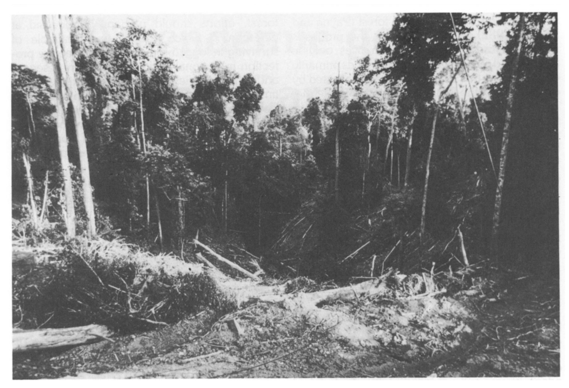
Aftermath of selective logging.

primates: food trees are lost only through incidental damage during logging.