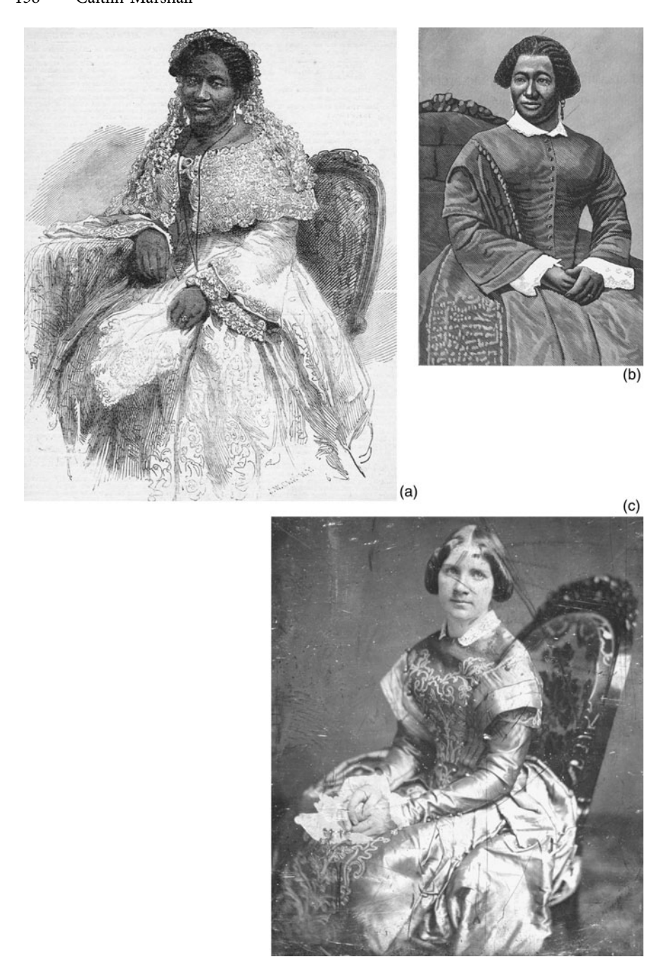
Figure 2. A wood engraving (a) and a still image (b) of Elizabeth Taylor Greenfield next to a daguerre-otype (c) of Jenny Lind.