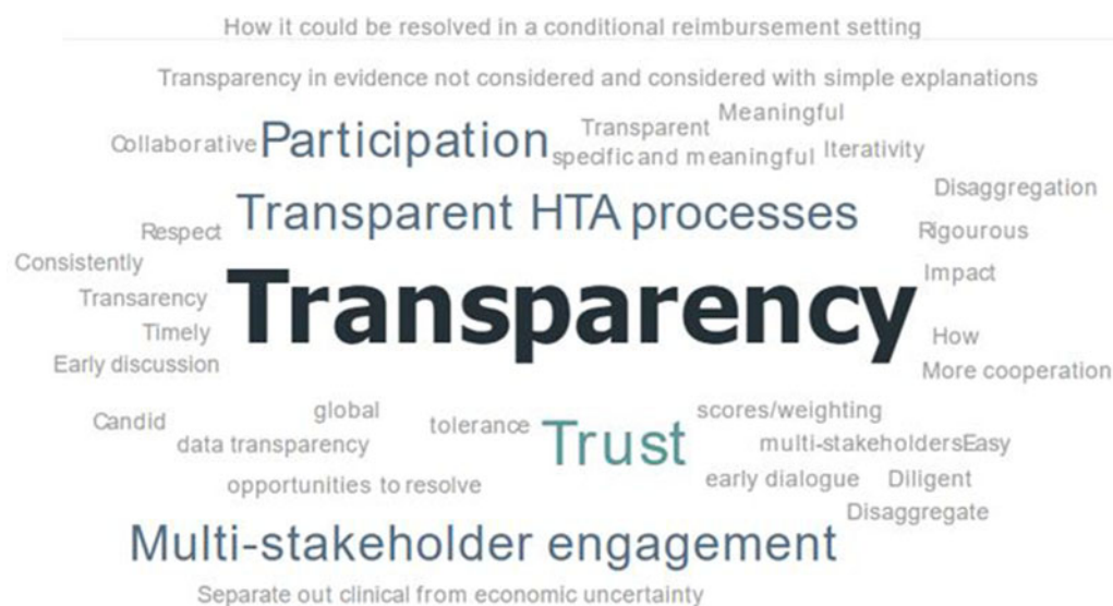
Figure 2. GPF member “word cloud” on considering and communicating uncertainty in HTA.

of trial design and outcome measurement to better clarify some of the uncertainties facing HTA agencies.