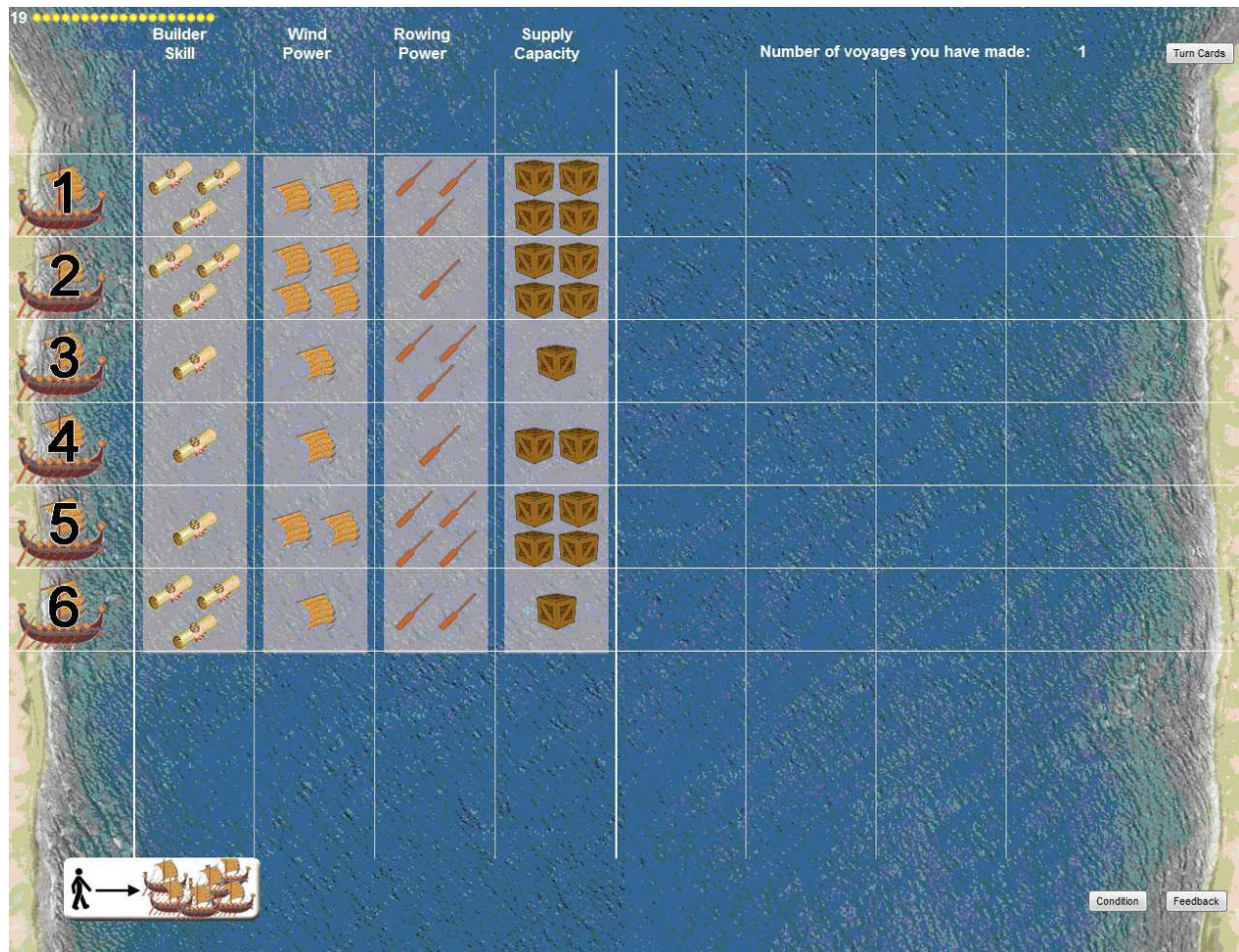
Figure 1: Screenshot of the task used in the new experiment.