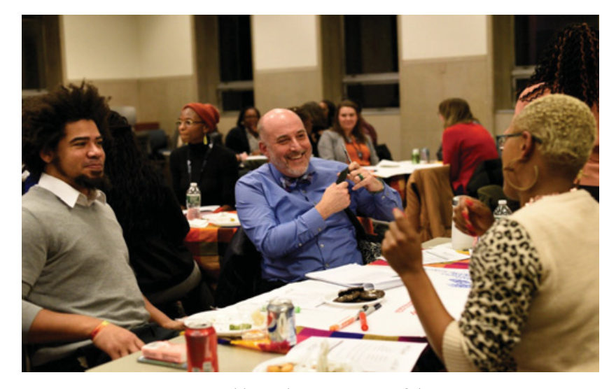
Figure 6 Networking.

tends to be ... And I'm a part of an ... Aspiring Anti-racist Museum Educators Reading Group and that's actually where some of the most powerful peer sharing and teaching and learning, in my experience, comes from.