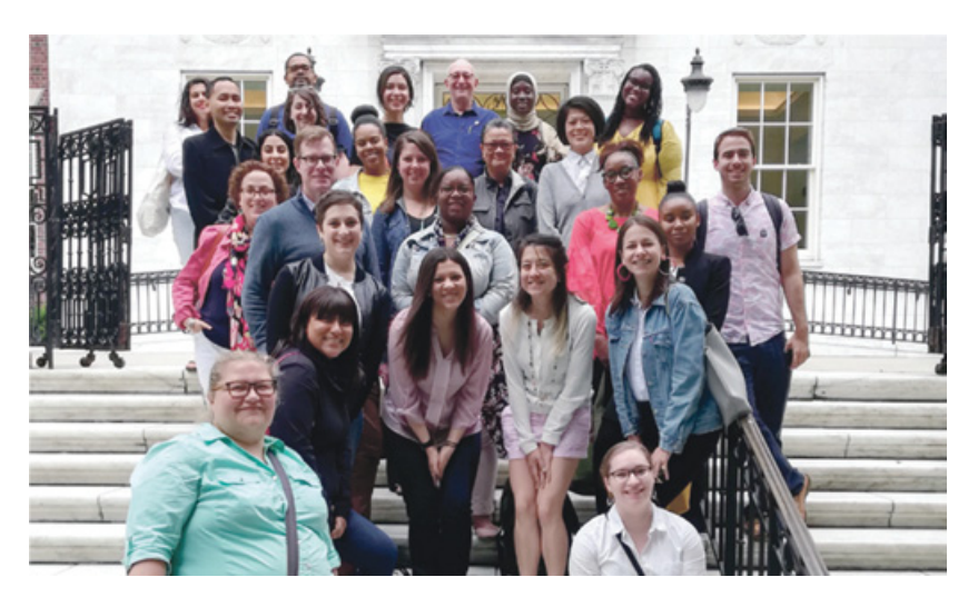
Figure 1 A New York Community Trust Leadership Fellows (NYCTLF) cohort

A participant once shared with me that the fellowship was the "Rosetta Stone" for her career and promotion into leadership positions. Yet, beyond the anecdotes, more systematic analysis has also been undertaken. In the first four years of the NYCTLF, an evaluation was conducted to identify the program's strengths and areas for improvement. The report examined all aspects of the fellowship in terms of its stated goals, namely to "increase the quality and diversity of leadership talent available to nonprofit organizations, with a priority focus on leaders of color" and to "improve the knowledge, skills, and confidence of mid-career professionals so that they become more effective managers and change leaders