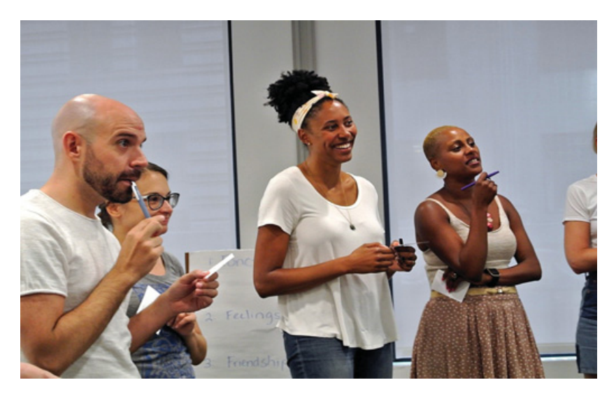
Figure 5 Learning for performance.

be "creative friction." Any tools that can help one get a greater view of their tendencies can help toward these goals. One participant explained: