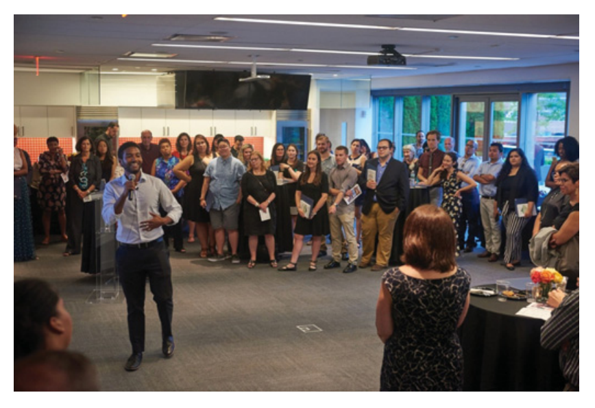
Figure 4 Leading from the center.

At the same time, the idea of distributing from the center can certainly be applied in leadership training itself (see Figure 4). One fellow mentioned that some colleagues in the program were in a "hierarchical" and "prescriptive environment" that provoked much thought among their group. Distributing from the center doesn't obviate that there may be times and places where a hierarchical style may be fitting, but it calls into question the continuing dominance of this approach for leadership in and across organizations. According to one person: "I think some