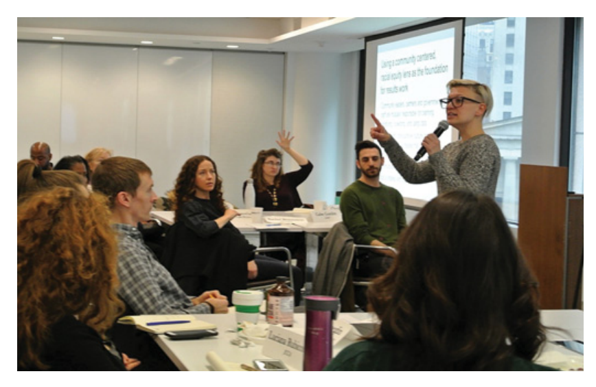
Figure 2 NYCTLF leadership training.

within their organizations" (Reinelt & Fried 2018a: 3). Over approximately two years, the evaluators carried out surveys, focus groups, and more with past and current cohorts, program faculty, and other stakeholders to capture the program's perceived impacts and make recommendations for future planning.