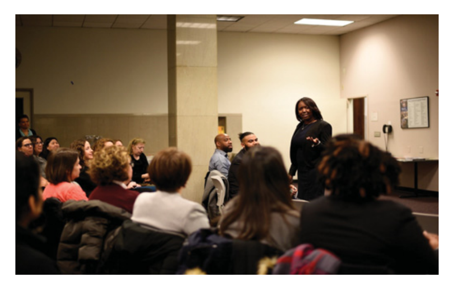
Figure 7 Elevating leadership.

perspectives" (Dreier, Nabarro, & Nelson 2019). For those who have never given much thought to these matters, leadership standpoints flow with these currents. The emphasis on multiplicity and social and ecological compassion within leadership standpoints also relates to "multidimensional authenticity" that recognizes "the many-layered and evolving nature of the self" living among others (Arora, Elawar, & Cheng 2019: 41). Since leaders often have the most influence in constructing and sustaining organizational culture, they need to be skilled at performing multiple roles (including manager and administrator), promoting an ecology of collaboration and participation (Golensky & Hager 2020: 81, 85, 125). The practices that can work with these themes are central to modern leadership.