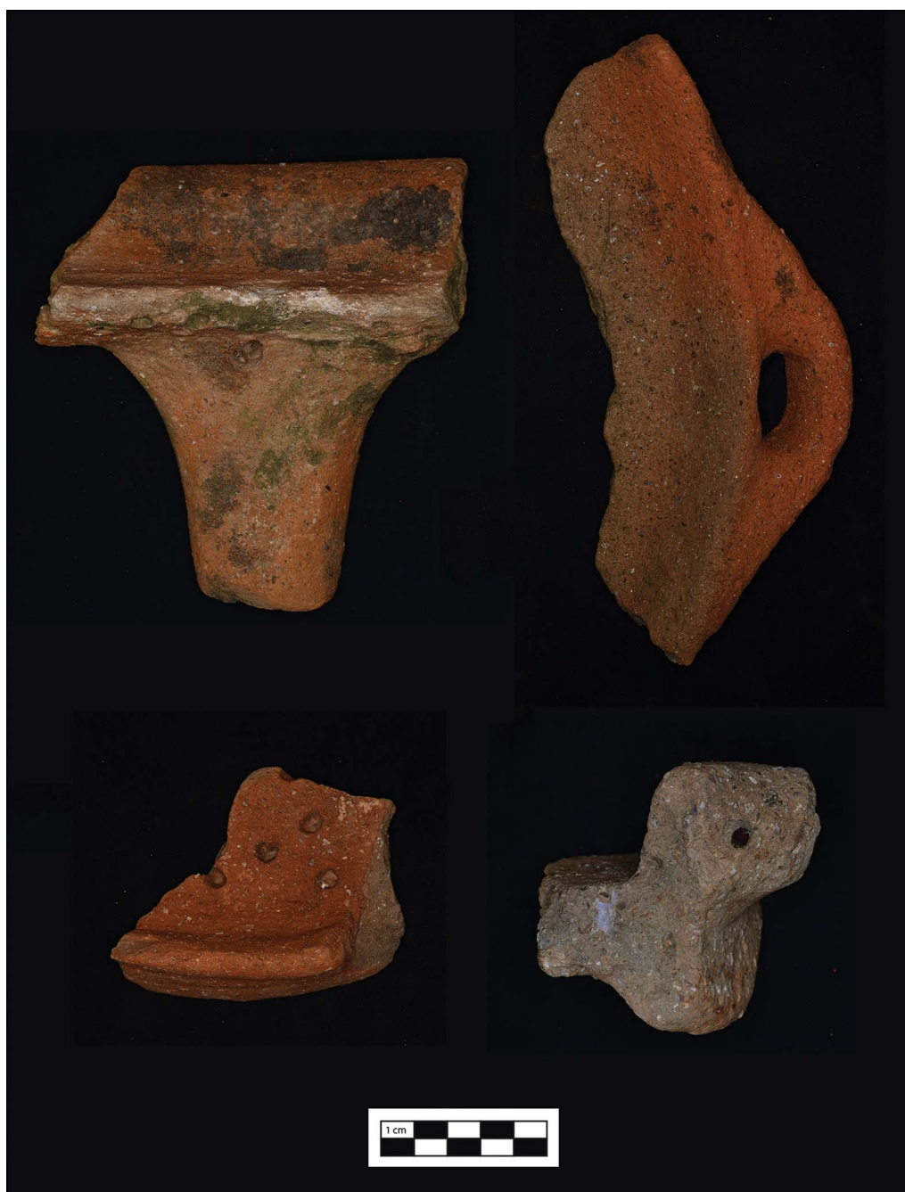
Figure 3. Cooking vessels from Raftis.