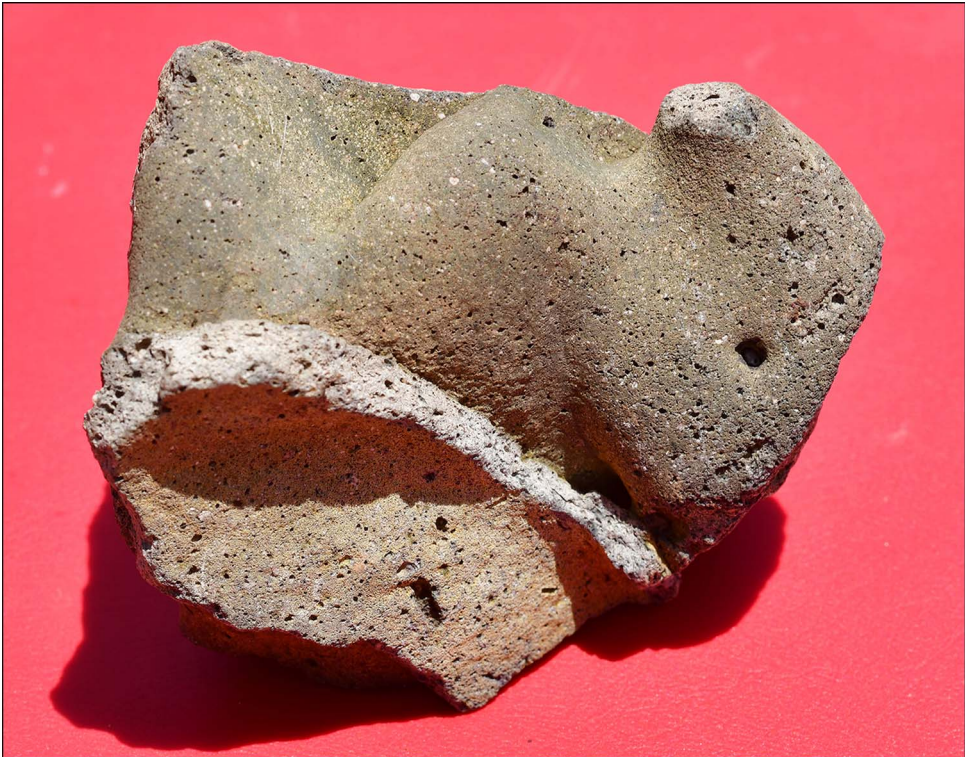
Figure 5. A White Ware waster from Praso.