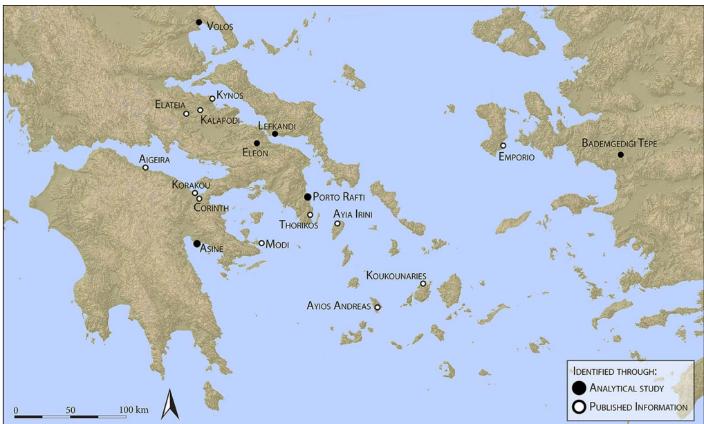
Figure 6. Sites where certain or probable White Ware exports have been identified (map by S. Murray and B. Lis).