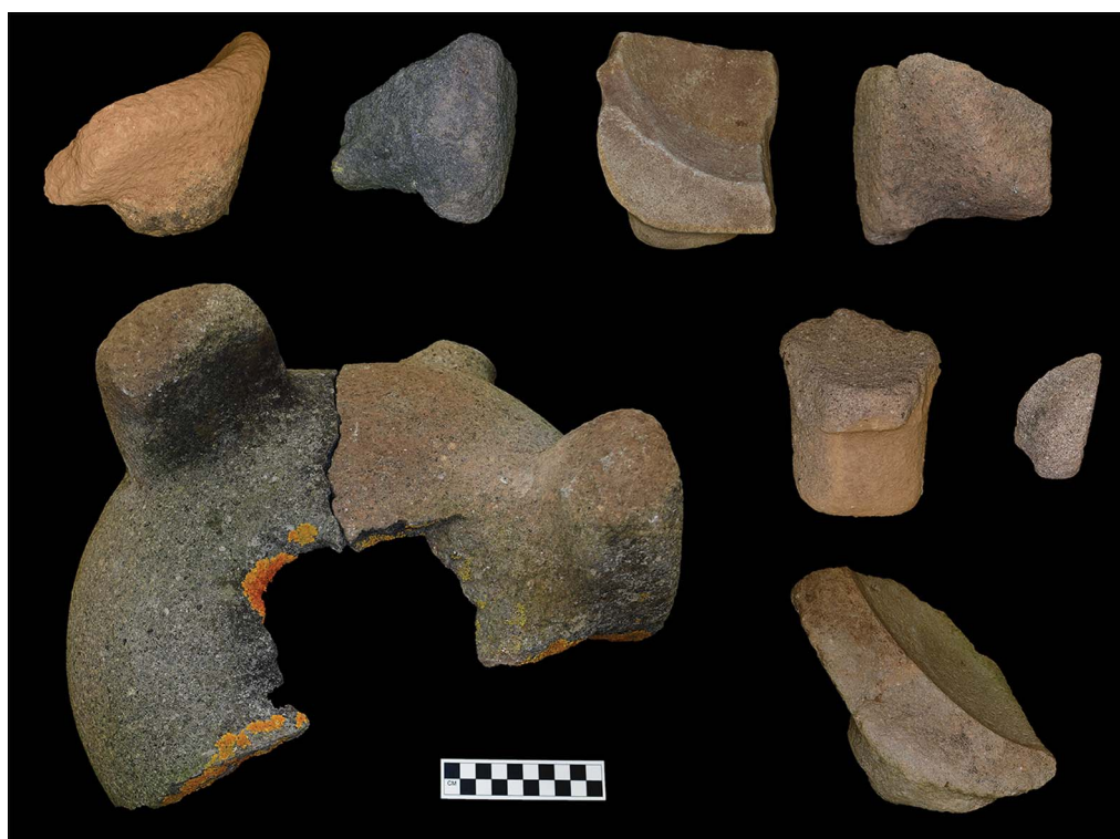
Figure 4. Tripod mortar fragments from Raftis.

during volatile times. Yet it seems that, for Porto Rafti's inhabitants, the islands also offered another advantage: immediate proximity to maritime routes (Kramer-Hajos 2016: 174–78). These stretched north to the Euboean Gulf, east through the Cyclades to western Anatolia and Cyprus, and south towards the Peloponnese, as the distribution of White Ware indicates (see Figure 6). Here, we would like to suggest that the crucial factor in this community's success may have been its possession of wide-ranging practical knowledge related to both the crafts practiced in Porto Rafti and an ability to distribute the resulting products through maritime networks.