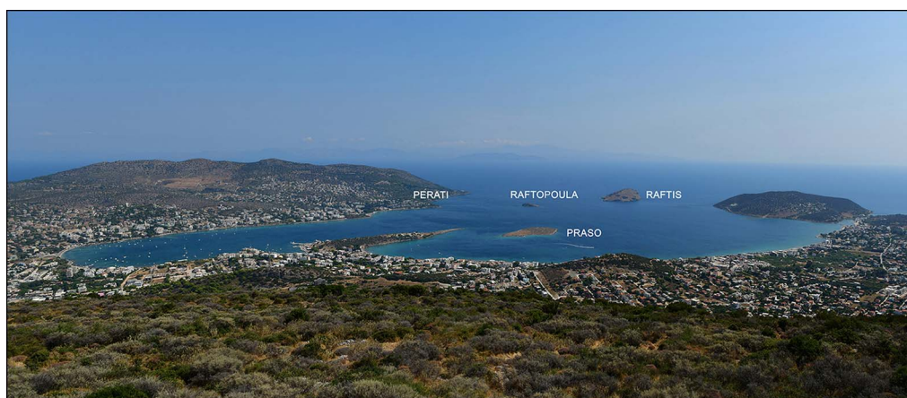
Figure 2. Raftis, Praso and Raftopoula Islands.

rare type of tripod mortar (Figure 4) and several pieces of un-worked or semi-worked non-native volcanic raw materials, as evidence that grinding, hammering and pounding tools were being manufactured on Raftis. Possible evidence for metal processing is present in the form of sherds from metallurgical ceramics.