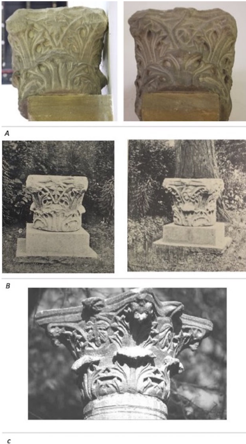
Fig 3. Lyre Capital from the Blachernai area and comparisons. A) Lyre Capital, Blachernai area, Constantinople, 5th-6th c., Lower Kingswood (Surrey), Church of the Holy Wisdom of God; B) Lyre Capital from the Blachernai area as it appears in Freshfield's Memorandum (1903); C) Lyre capital, 5th-6th c., Ayasofya courtyard (after Guiglia, Barsanti, Paribeni 2008).