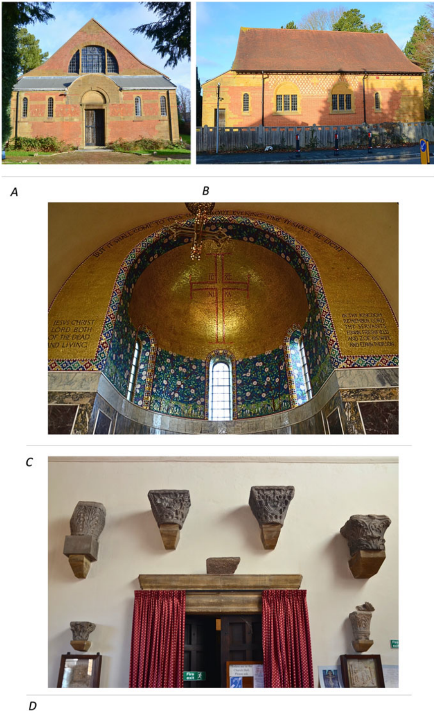
Fig 1. Church of the Holy Wisdom at Lower Kingswood (Surrey), England. A) Exterior, western façade; B) Exterior, northern façade; C) Interior, Apse mosaic showing one dedicatory inscription from Freshfield and his family (1902–3). D) Interior, western façade with most of the capitals mentioned in the Memorandum.