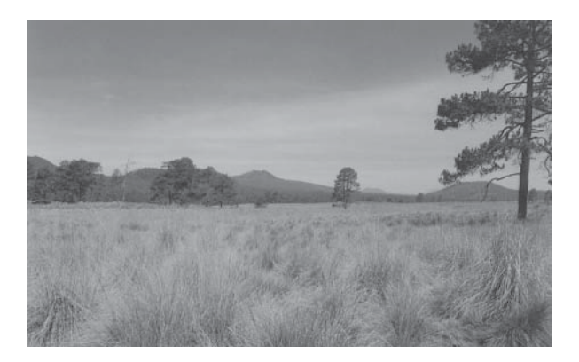
Plate 1 Typical Sierra Madre sparrow habitat. L. Cabrera-García, 2001.

Eight plant communities were delimited within the Sierra Madre sparrow's current range. The attributes and differences that characterize each community are given in Table 1, and the floristic composition of each community in the phytosociological table (Appendix). The total