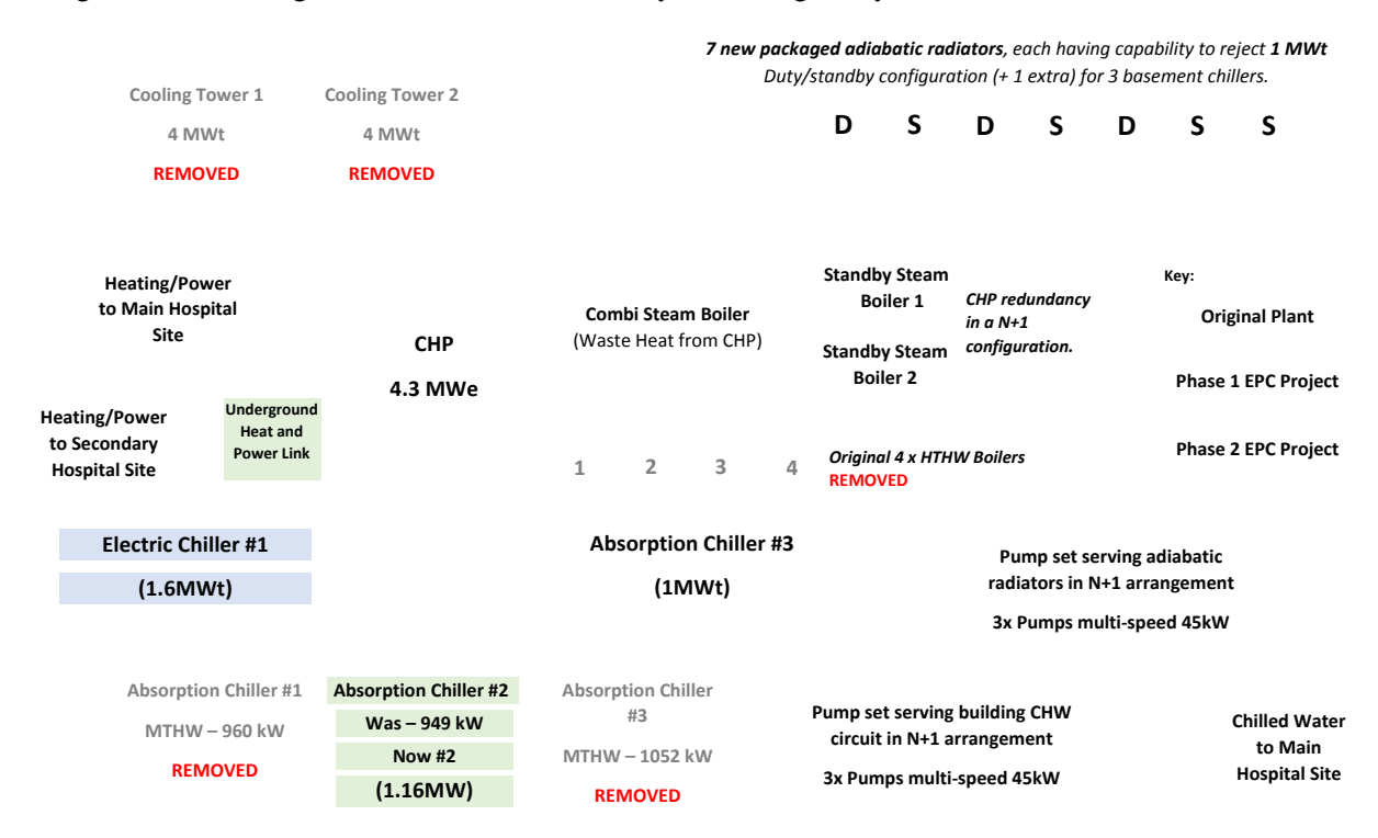
Figure 1. Modelling of the original and current hospital installations

considerable. Figure 1 provides a model overview of the original hospital systems installed in the 1980's alongside Phase 1 (in green) and Phase 2 (in blue) systems; original systems removed are also illustrated.