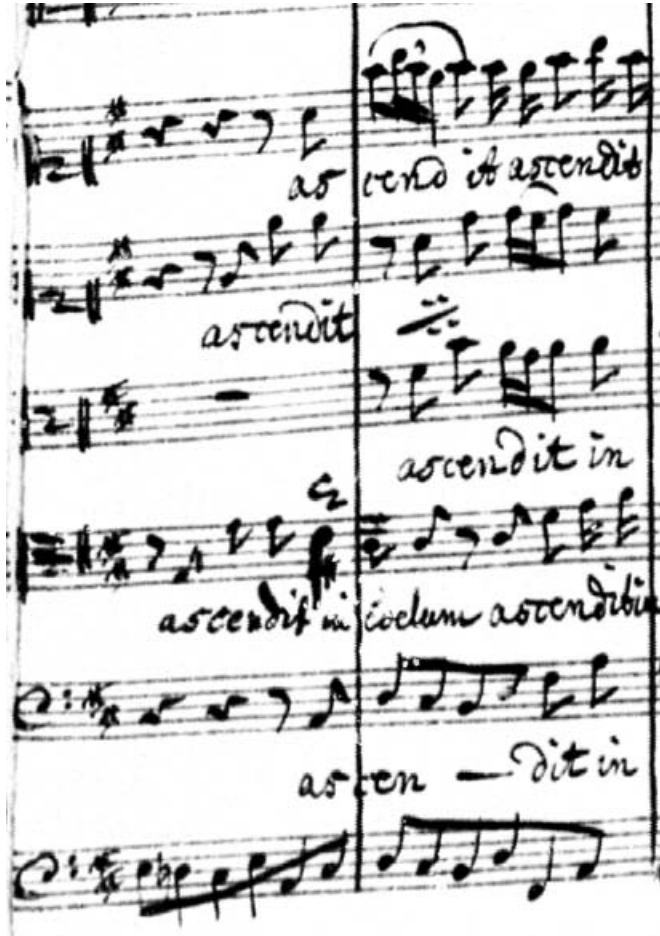
Figure 1 'Et resurrexit', bars 58–59 (voices and continuo), Source B (all figures Staatsbibliothek zu Berlin – Preußischer Kulturbesitz; used by permission)

would he have had any reason to view the autograph as a sacrosanct historical document rather than as part of a living practice. But his efforts have left us with a host of difficulties. While his interventions in the Missa , the Sanctus and the final catch-all of movements from 'Osanna' to 'Dona nobis pacem' do not generally cause much trouble, his repeated involvement with the Symbolum , not least as a performing musician rather than an archivist, creates problems of another dimension. Emanuel's hand does not always differ obviously from that of his father. Not only that, but he didn't hesitate to overwrite his father's entries; and worse yet, his well-known obsession with neatness moved him at times to erase those entries with a razor before entering his own readings. Comparison with the copies, aided by close visual examination of the autograph, does make it possible to eliminate many of Emanuel's additions, and to restore much of what he covered over or scraped away. Nevertheless, there remain more than enough places where even the most patient scrutiny leaves us in the dark as to what J. S. Bach actually wrote. As we shall see, some of them concern particularly crucial spots in the music.