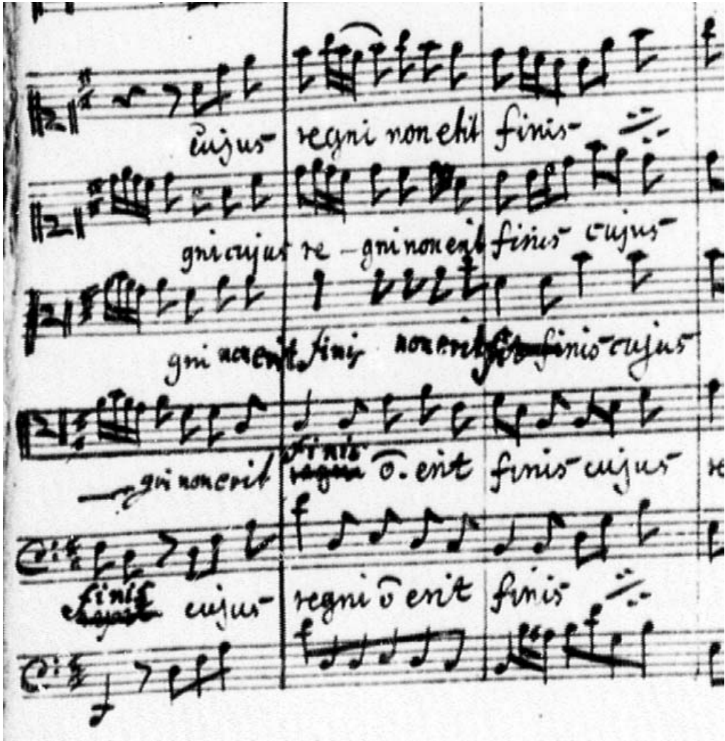
Figure 8 'Et resurrexit', bars 97–99, source B

this happens to humanists time and again. But at the same time, the apparent shortcomings of the XRF investigation should not give musicological Luddites anything to cheer about. We need the technology; and I can well imagine that, with a return to the drawing-board and some reconsideration of methods, measurements and perhaps even equipment, the kind of pioneering work that Wolf, Hahn and Wolff have done will indeed bring us closer to solutions than we could come before.