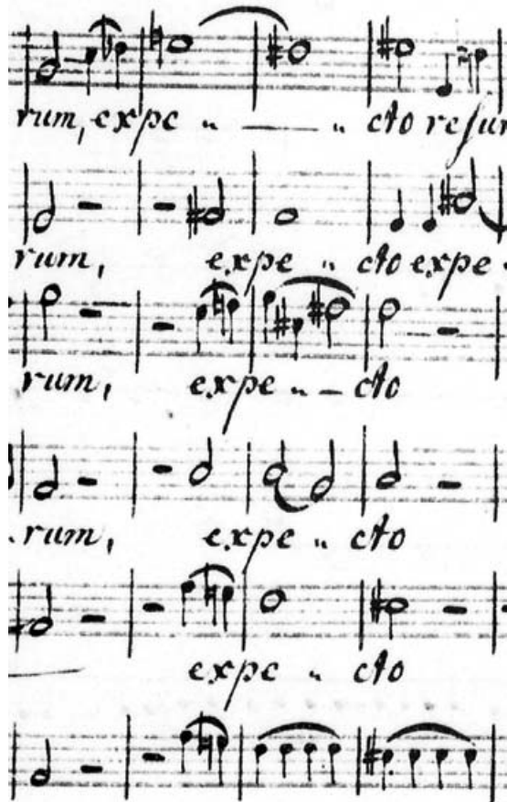
Figure 6 'Confiteor', bars 137–140, Source G

speculate as to why the copyists did not notice this staff. Possibly the crossing-out was at first not so clear as it is today and the copyists tried still to read the principal staff – and came to grief.