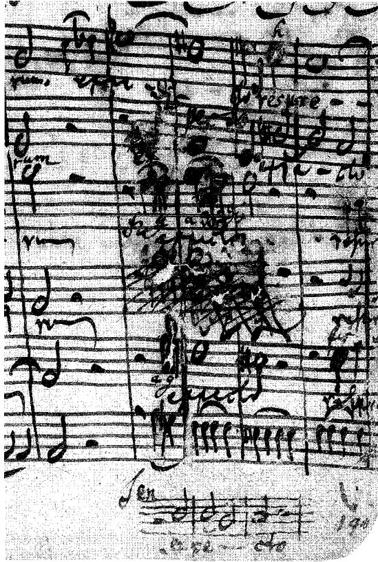
Figure 3 'Confiteor', bars 137–141, Source A

places in the latest autograph portion of the Art of Fugue , I decided to accept it. 6 Now Wolf reports that the sharp in fact comes from Emanuel's hand. 7 I see no real reason to dispute this, though the spacing continues to give me pause.