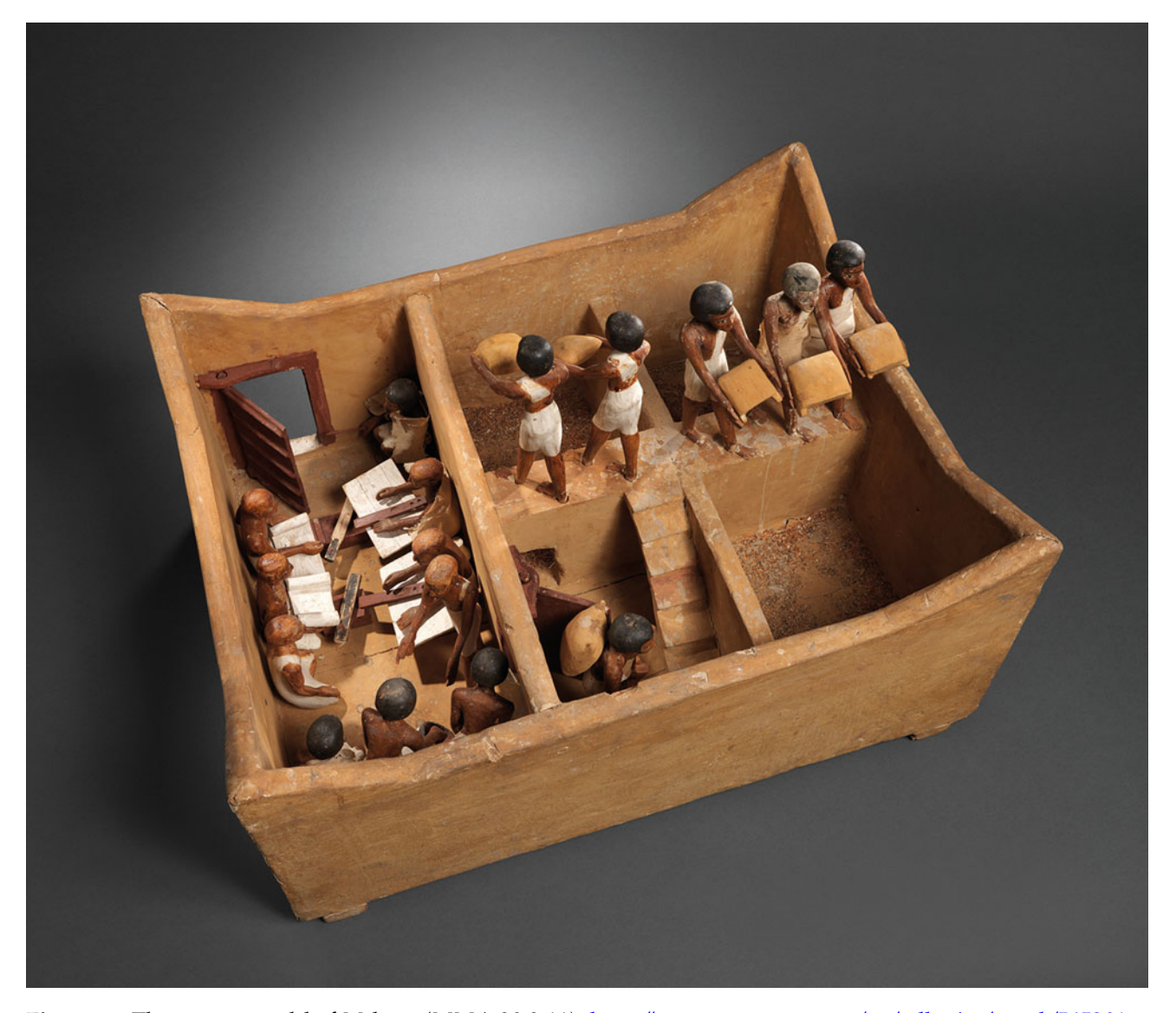
Figure 1. The granary model of Meketre (MMA 20.3.11). https://www.metmuseum.org/art/collection/search/545281