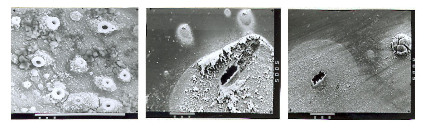
Figure 1. SEM photomicrographs showing various configurations of pits on Al 6061 after anodic polarization in 3%NaCl at pitting potential ( E_{cpit} ).