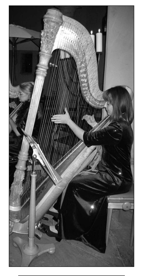
La Rose performed during the conference dinner concert.

Advances in tissue engineering implants depend on the successful use of biocompatible materials that can be accommodated in living cells. A major problem is that living tissue and bones