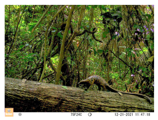
PLATE 1 A black-bellied pangolin Phataginus tetradactyla photographed walking on a log in Deng Deng National Park, Cameroon (Fig. 1).

Cameras operated for a total of 1,571 trap-days across the 33 camera-trap stations. One camera-trap station (at 726 m elevation) provided a single photographic event (three sequential photographs) after 35 trap-days of an adult black-bellied pangolin walking on top of a log in a secondary forest at 11.47 (Plate 1). In this habitat the canopy was relatively open (25% canopy cover), with a dense understorey. The black-bellied pangolin trapping rate was 0.063 events per 100 trap-days and the capture probability was low (0.0006 captures per day), with one event being recorded in 1,571 trap-days.