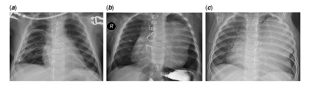
Figure 2. Serial chest radiographs from Patient 1 depicting aneurysm progression from ( a ) the day of tetralogy of Fallot repair, ( b ) 2 months later with an enlarging cardiac silhouette and opacity at the left superior aspect of the heart, and ( c ) just prior to aneurysm resection.