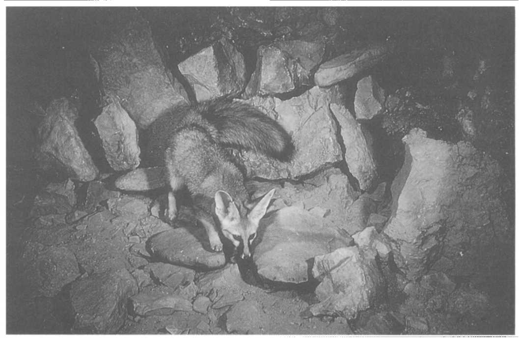
Blanford's fox in Israel.